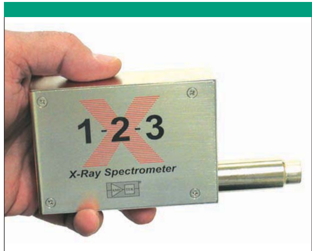
Figure 1: X-123 measures 2.7 x 3.9 x 1 in. (7.3 x 10.3 x 2.5 cm).

light tight, vacuum tight thin Beryllium window to enable soft X-ray detection.