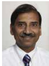
Sundar Jagannath, MD

low-dose dexamethasone. According to Karyopharm, the study defined penta-refractory as “patients who have previously received at least 1 alkylating agent, glucocorticoids, 2 immunomodulatory drugs (IMiDs; lenalidomide [Revlimid] and pomalidomide [Pomalyst]), 2 proteasome inhibitors (PIs; bortezomib [Velcade] and carfilzomib [Kyprolis]), and daratumumab (Darzalex), and whose disease is refractory to glucocorticoids, at least 1 PI, at least 1 IMiD, and daratumumab, and whose disease has progressed following their most recent therapy.”