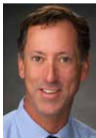
John M. Pagel, MD, PhD

Iomab-B was generally well tolerated. Most adverse events discovered were manageable. Of a total of 58 patients, 17% had chills, with 20% requiring treatment with meperidine; 12% experienced nausea and vomiting; and 26% developed respiratory symptoms, such as throat or chest tightness. In addition, 2% of patients developed grade 2 hypotension that required treatment with parenteral fluids. 2 The drug also can cause mucositis but is otherwise well tolerated, Pagel said.