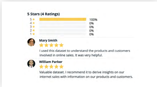
Figure 1: Easily collaborate with data leveraging crowdsourcing capabilities