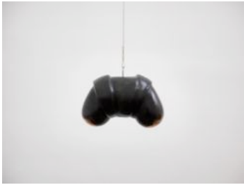
LOUISE BOURGEOIS HANGING JANUS, 1968 BRONZE, DARK AND POLISHED PATINA, HANGING PIECE 17.5 X 27.9 X 15.9 CM. COLLECTION FAURSCHOU FOUNDATION