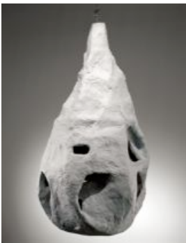
LOUISE BOURGEOIS FÉE COUTURIÈRE, 1963 BRONZE, PAINTED WHITE, HANGING PIECE 100.3 X 57.2 X 57.2 CM. COLLECTION FAURSCHOU FOUNDATION