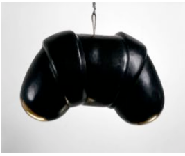
LOUISE BOURGEOIS HANGING JANUS, 1968 BRONZE, DARK AND POLISHED PATINA, HANGING PIECE 17.5 X 27.9 X 15.9 CM. COLLECTION FAURSCHOU FOUNDATION

PHOTO: CHRISTOPHER BURKE, © LOUISE BOURGEOIS TRUST / LICENSED BY VAGA, NY