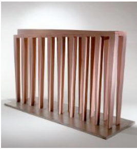
LOUISE BOURGEOIS C.O.Y.O.T.E., 1947-1949 BRONZE, PAINTED PINK, AND STAINLESS STEEL 131.8 X 209.6 X 28.9 CM. COLLECTION FAURSCHOU FOUNDATION