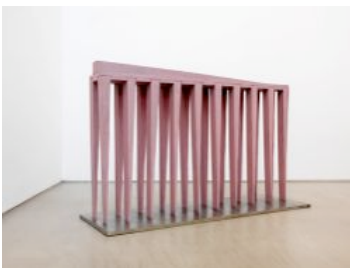
LOUISE BOURGEOIS C.O.Y.O.T.E., 1947-1949 BRONZE, PAINTED PINK, AND STAINLESS STEEL 131.8 X 209.6 X 28.9 CM. COLLECTION FAURSCHOU FOUNDATION