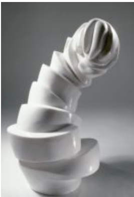
LOUISE BOURGEOIS LABYRINTHINE TOWER, 1962-1981 WHITE MARBLE: 92.7 X 61 X 50.8 CM. TIMBER: 28 X 66 X 58.4 CM. COURTESY CHEIM & READ AND HAUSER & WIRTH