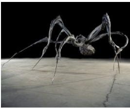
LOUISE BOURGEOIS CROUCHING SPIDER, 2003 STEEL 270.5 X 835.7 X 627.4 CM.