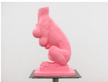
LOUISE BOURGEOIS NATURE STUDY, 1984; CAST 2000 PINK RUBBER: 76.2 X 48.3 X 38.1 CM. STAINLESS STEEL BASE: 104.1 X 55.2 X 55.2 CM.