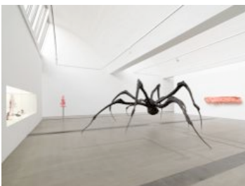
PHOTO: JONATHAN LEIJONHUFVUD, © LOUISE BOURGEOIS TRUST / LICENSED BY VAGA, NY

INSTALLATION VIEW OF THE EXHIBITION 'LOUISE BOURGEOIS: ALONE AND TOGETHER' AT FAURSCHOU FOUNDATION, BEIJING, 2012.