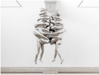
LOUISE BOURGEOIS THE COUPLE, 2003 ALUMINUM, HANGING PIECE 365.1 X 200 X 109.9 CM. COURTESY CHEIM & READ AND HAUSER & WIRTH

PHOTO: JONATHAN LEIJONHUFVUD, © LOUISE BOURGEOIS TRUST / LICENSED BY VAGA, NY