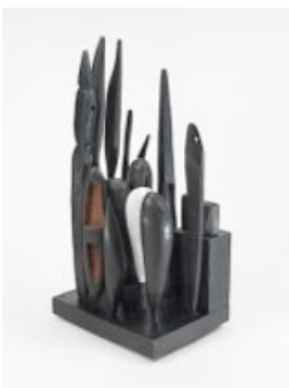
LOUISE BOURGEOIS FORÊT (NIGHT GARDEN), 1953 BRONZE WITH BROWN AND BLACK PATINA AND WHITE PAINT 92.1 X 47 X 36.8 CM. COLLECTION FAURSCHOU FOUNDATION