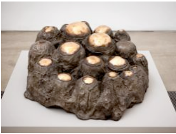
LOUISE BOURGEOIS AVENZA REVISITED, 1968-1969 BRONZE, SILVER NITRATE AND POLISHED PATINA 43.2 X 104.1 X 88.9 CM. COLLECTION FAURSCHOU FOUNDATION