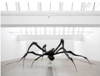
LOUISE BOURGEOIS CROUCHING SPIDER, 2003 STEEL 270.5 X 835.7 X 627.4 CM. COURTESY THE EASTON FOUNDATION

PHOTO: JONATHAN LEIJONHUFVUD, © LOUISE BOURGEOIS TRUST / LICENSED BY VAGA, NY