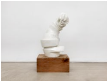
LOUISE BOURGEOIS LABYRINTHINE TOWER, 1962-1981 WHITE MARBLE: 92.7 X 61 X 50.8 CM. TIMBER: 28 X 66 X 58.4 CM. COURTESY CHEIM & READ AND HAUSER & WIRTH