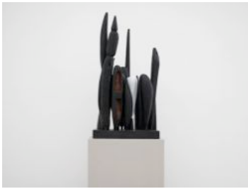
LOUISE BOURGEOIS FORÊT (NIGHT GARDEN), 1953 BRONZE WITH BROWN AND BLACK PATINA AND WHITE PAINT 92.1 X 47 X 36.8 CM. COLLECTION FAURSCHOU FOUNDATION