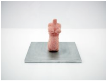
LOUISE BOURGEOIS PREGNANT WOMAN, 2002 FABRIC, GLASS AND ALUMINUM 32.4 X 30.5 X 30.5 CM. COURTESY THE EASTON FOUNDATION

PHOTO: JONATHAN LEIJONHUFVUD, © LOUISE BOURGEOIS TRUST / LICENSED BY VAGA, NY