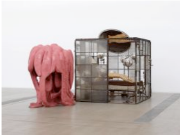
LOUISE BOURGEOIS IN AND OUT, 1995 METAL, GLASS, PLASTER, FABRIC AND PLASTIC CELL: 205.74 X 210.8 X 210.8 CM. PLASTIC: 195 X 170 X 290 CM.