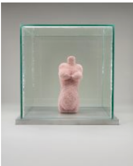
LOUISE BOURGEOIS PREGNANT WOMAN, 2002 FABRIC, GLASS AND ALUMINUM 32.4 X 30.5 X 30.5 CM. COURTESY THE EASTON FOUNDATION

PHOTO: CHRISTOPHER BURKE, © LOUISE BOURGEOIS TRUST / LICENSED BY VAGA, NY