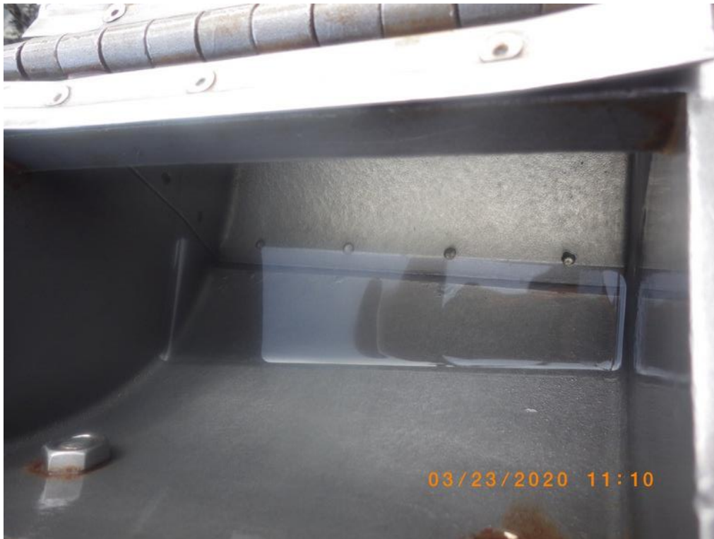
A typical unsuccessful grab attempt at the station outside the AZE on Transect A at the Culloden site on March 23, 2020.