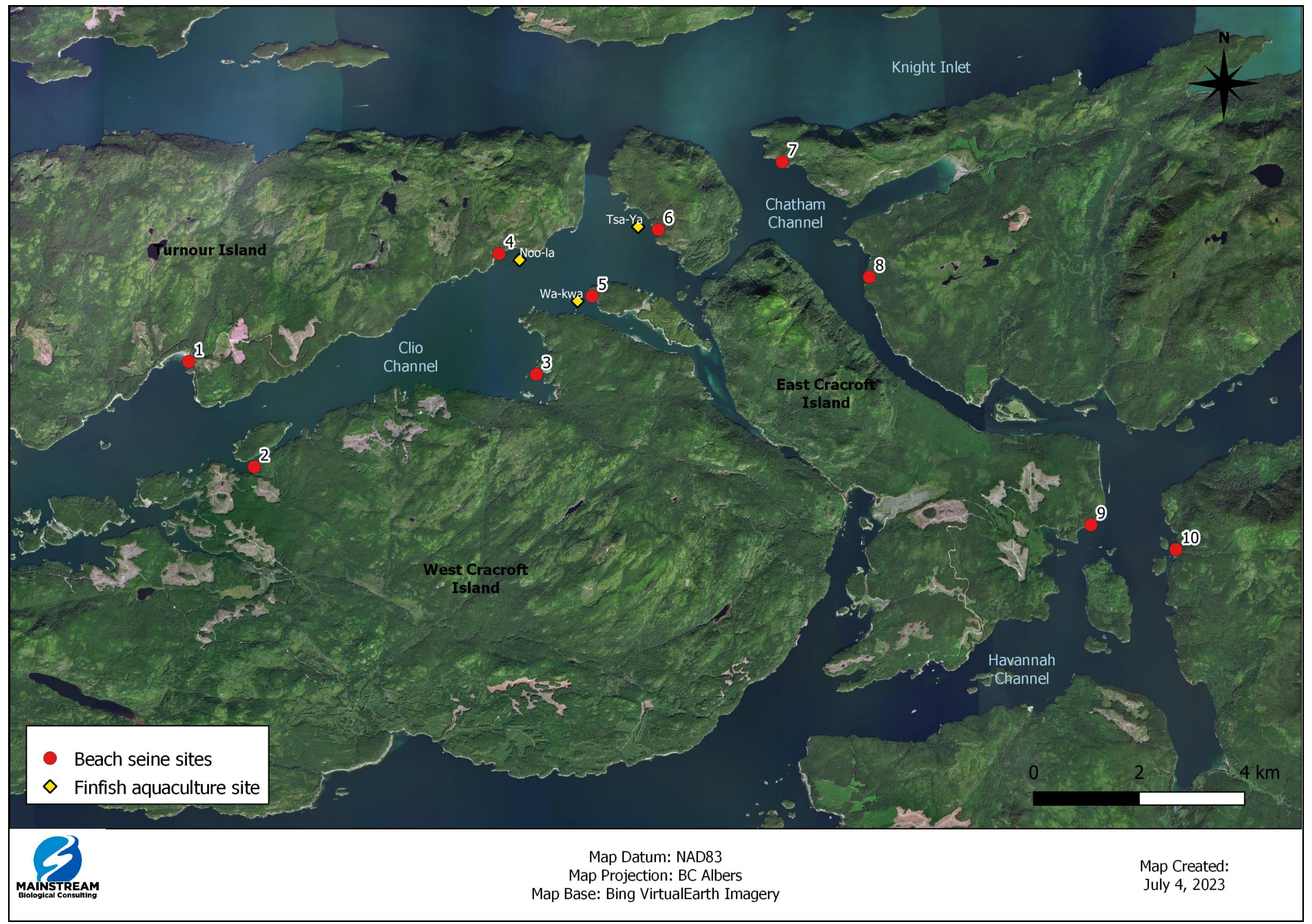
Figure 2: The locations of the 10 beach seine sites in Clio Channel and Chatham Channel, BC sampled in 2023.