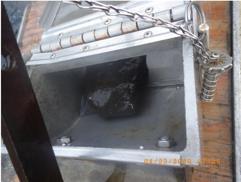
Typical grab result at the station outside the AZE on Transect A at the Vantage site on April 23, 2020.