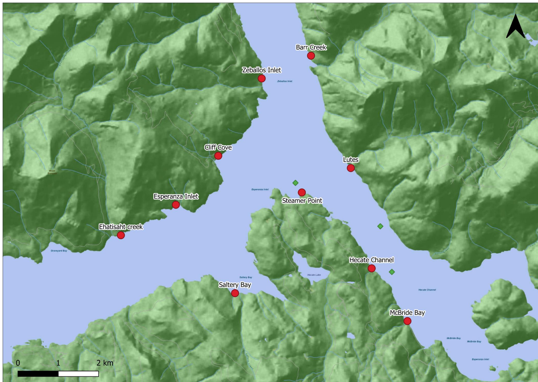
Figure 2: The locations of the 10 beach seine sites in Esperanza Inlet sampled in 2022. Grieg Seafood's active aquaculture tenures are indicated with a green diamond.