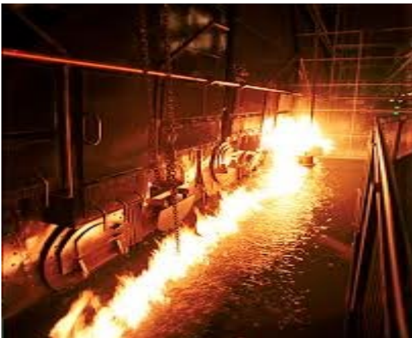
Example: Fuel oil ablaze after spraying onto hot surface

Compared to fuel leakage from High Pressure Fuel Pipes, leakage from Low Pressure Pipes can be more serious due to the steady, voluminous flow of oil providing a continuous source of fuel to the fire until it runs out / is stopped.