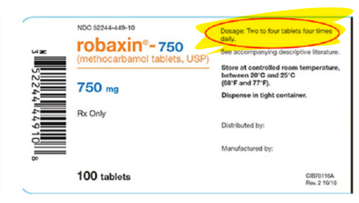
(U.S. Food & Drug Administration, 2018)1

In September 2018, a pharmaceutical company was forced to recall multiple lots of Robaxin tablets due to a labeling error in the dosing information, which put patients at risk for overdosing, seizures, coma, or death. The correct dose was 2 tablets 3 times a day!