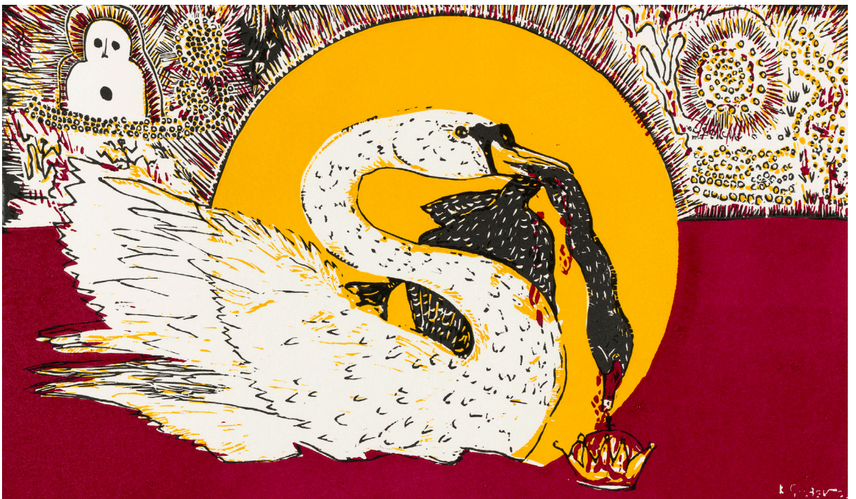
Kevin Gilbert Colonising Species , 1989 Screenprint on paper Murray Art Museum Albury collection Purchased, 2020