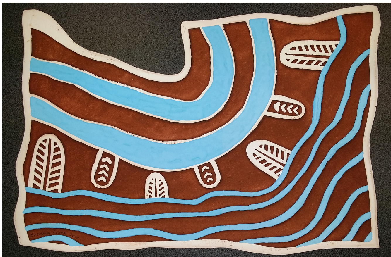
Treahna Hamm Untitled, 2010 Hand coloured etching Murray Art Museum Albury collection Purchased 2015