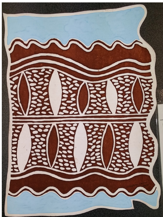
Treahna Hamm Untitled, 2010 Hand coloured etching Murray Art Museum Albury collection Purchased 2015