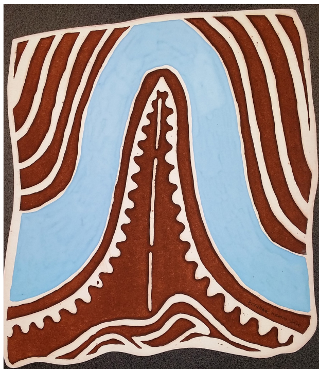
Treahna Hamm Untitled, 2010 Hand coloured etching Murray Art Museum Albury collection Purchased 2015