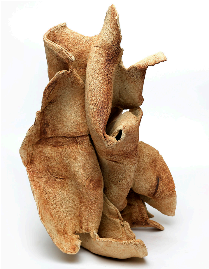
Nicole Foreshow Remain , 2015 Clay and iron oxide Murray Art Museum Albury collection Donated by the artist, 2016 Commissioned by Murray Art Museum Albury for the exhibition Wiradjuri Ngurumbangu , 2015