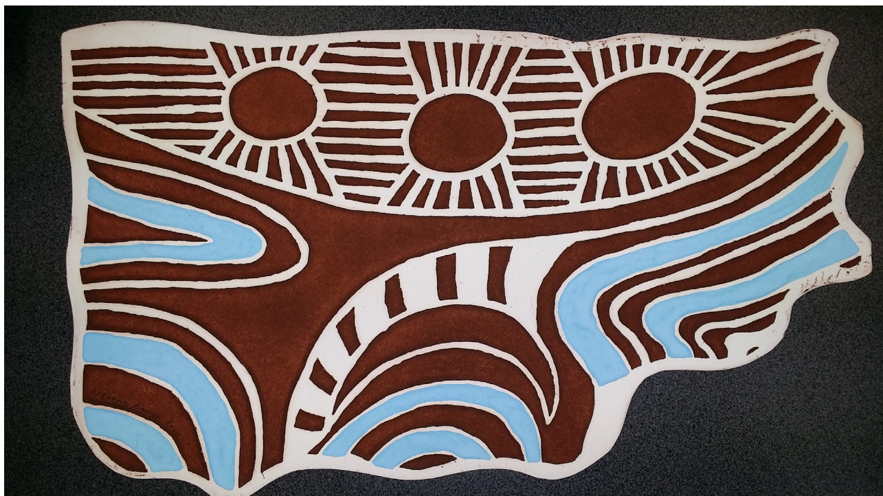
Treahna Hamm Untitled, 2010 Hand coloured etching Murray Art Museum Albury collection Purchased 2015