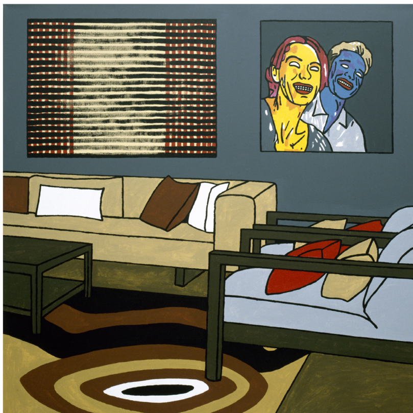
John Citizen Interior (Tribal Rug) , 2006 Acrylic on linen, 152 x 152cm