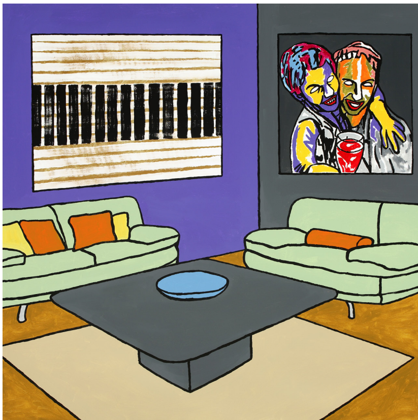
John Citizen Interior (Green Lounge Suite) , 2006 Acrylic on linen, 152 x 152cm Courtesy and © The Estate of Gordon Bennett