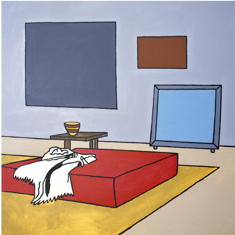
John Citizen Interior (Digital Art) , 2005 Acrylic on linen, 152 x 152cm Courtesy and © The Estate of Gordon Bennett