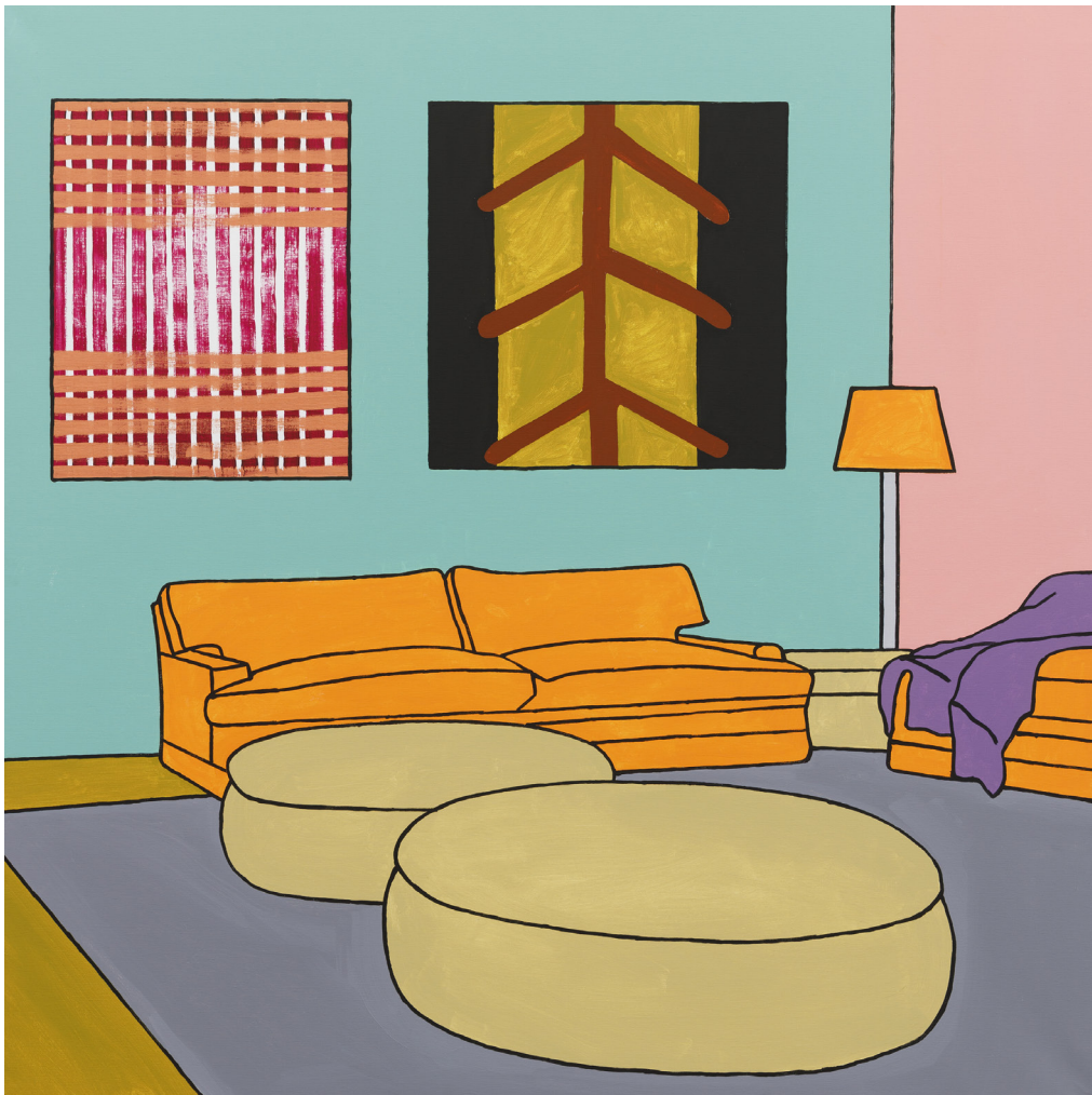
John Citizen Interior (Orange Lampshade) , 2008 Courtesy The Estate of Gordon Bennett and Sutton Gallery