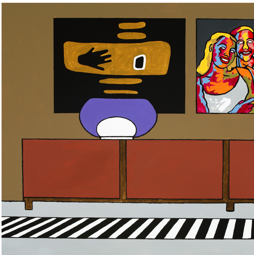
John Citizen Interior (Sideboard) , 2006 Acrylic on linen, 152 x 152cm Courtesy and © The Estate of Gordon Bennett