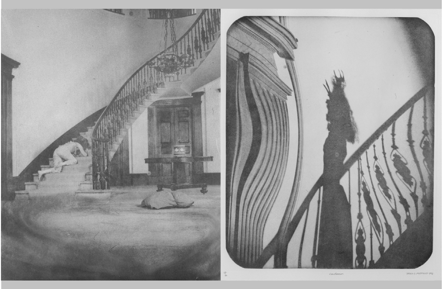
Tracey Moffatt (b. 1960) Laudanum #19, Laudanum #15, 1998 Toned photogravure prints on rag paper Purchased with funds from the New South Ministry, 2001

The Laudanum series that Moffatt created in 1998 is a dramatic, black and white series of photographs with a narrative that can be interpreted a number of different ways. The series seems to depict a crime scene where a violent act of homicide is being acted out between two women. It is an uncomfortable series which poses too many questions through the use of narrative breaks. Moffatt teases the audience with images that are fuzzy and distorted making them hard to read, suggesting the effects of the drug Laudanum , the woman possibly under its influence.