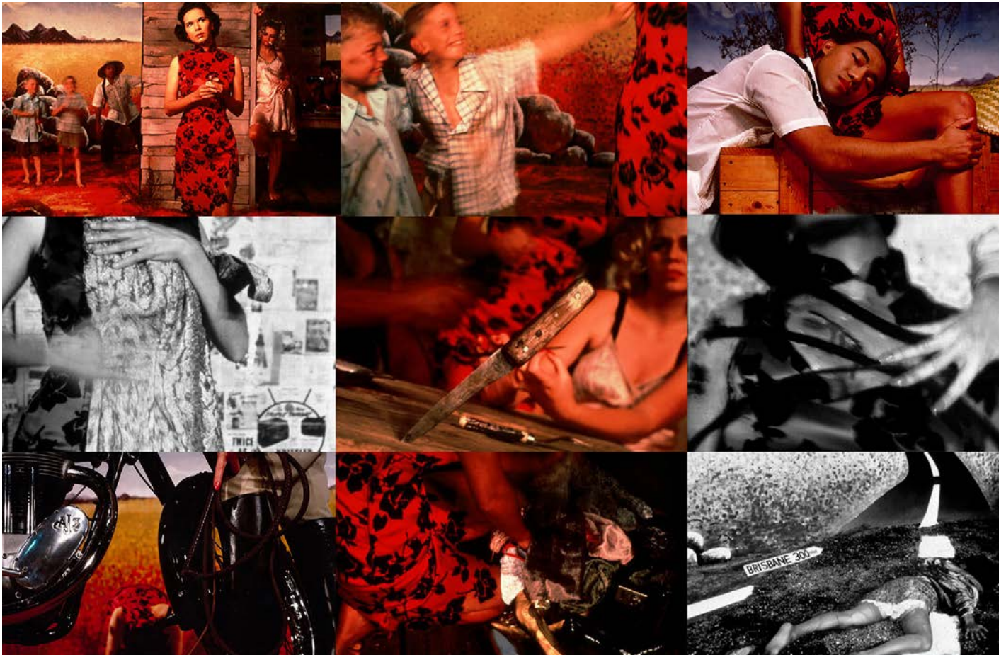
Tracey Moffatt (b. 1960) Something More #1 - #9 , 1989 Cibachrome photographs Commissioned by Albury Regional Art Gallery, 1989

In the first image of the series, Something More #1 , Moffatt plays the “star” standing in the centre of the frame wearing a bright red cheongsam. Behind her is a hut. A blonde woman wearing a negligee leans against the door, smoking a cigarette. Inside, a man sits at a table drinking from a bottle. Two children look on, and a boy wearing a conical hat, which originated in East, South and Southeast Asia, is seen peering around the back of the structure. The backdrop is an obvious artifice.