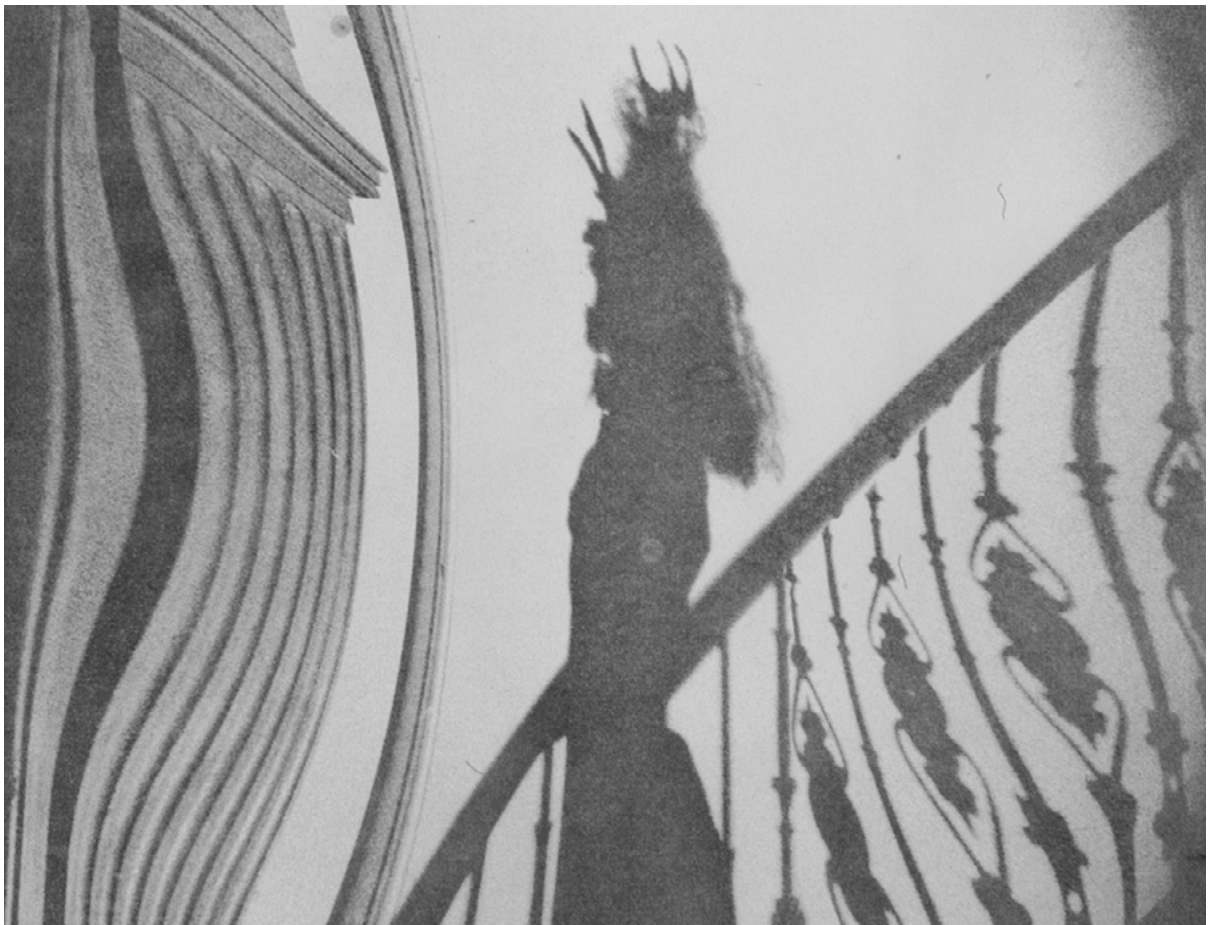
Tracey Moffatt (b. 1960) Laudanum #15 , 1998 Toned photogravure print on rag paper Purchased with funds from the New South Ministry, 2001