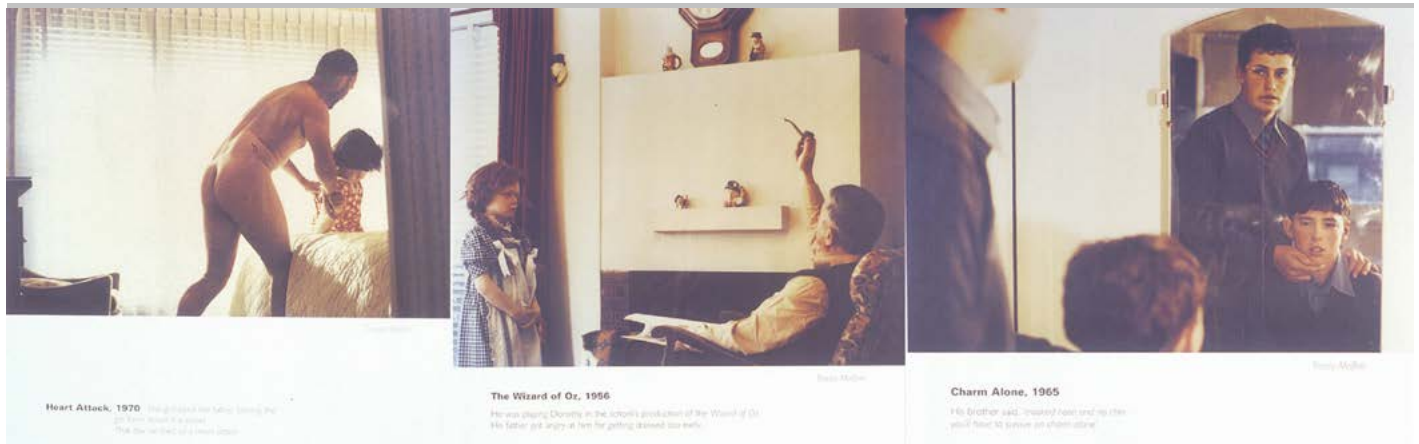
Tracey Moffatt (b. 1960) Charm Alone 1965, The Wizard of Oz 1956, Heart Attack 1970, 1989 photolithographs Purchased, 1995

The artfully staged series, Scarred for Life 1 and 2, captures the real memories of Moffatt and of many of her friends and family who passed on their stories to her. This series “dramatises the various indignities that parents (and other adults) can inflict on children: the offhand remark, the put-down, the careless abuse, and insult that ensures that the experience of growing up remains a handful of shameful memories.” 1 While these images are sometimes humorous they also contain a very serious message about wrong doings that have happened in these people’s lives. “Each individual work betrays the persistence of childhood and adolescent trauma lodged within adult memory. Each work is generated from such memory of psychological scarring – of moments in which childhood consciousness is fractured by the abrasive intent of others.” 2 Each photograph is also captioned guiding the viewer as to how to read the image, telling them how the subject had been ‘scarred for life’. Some images contain a caption describing only what is occurring in the images, leaving the viewer to wonder what happened to this person in the future; while others also describe an action prior to the image, sometimes sharing a consequence of the shown abusers behaviour. For example in Heart Attack , 1970 the caption tells the viewer what happened to both people in the photograph. The caption states, “She glimpsed her father belting the girl from down the street. That day he died of a heart attack.”