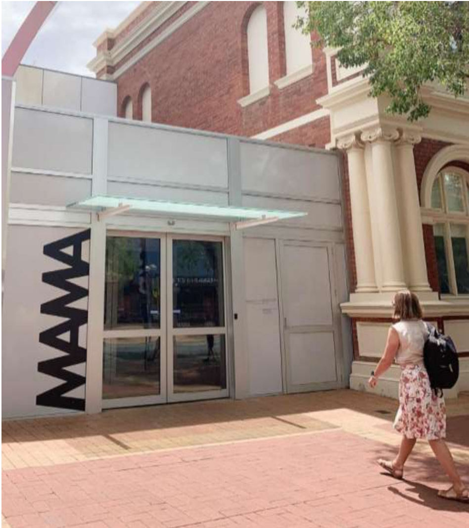
Left: a person wearing a backpack walking towards the Museum entrance.

We can enter the Museum through the front entrance on Dean street.