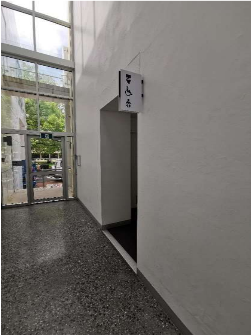
Left: view of the hallway with bathroom signs on the right and a glass door at the end.

The bathrooms are located on the ground floor at the end of the hallway.