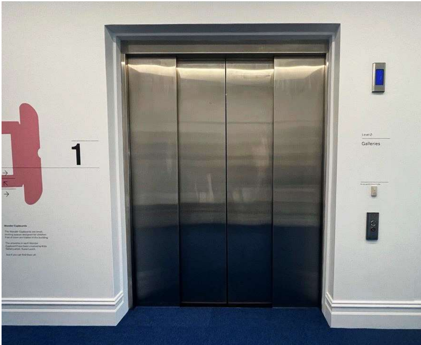
Left: the lift (doors closed) on level 1.

This is what the lift looks like from the outside.