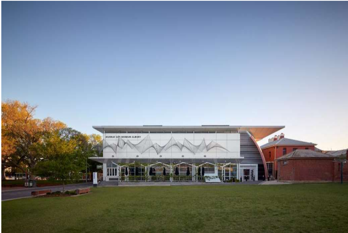
Left: view of the Museum from QEII Square.

This is what the back of the building looks like from QEII Square.