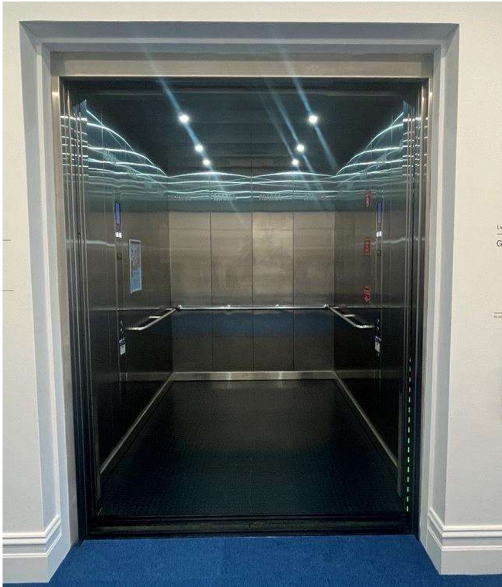
Left: the lift (doors open) on level 1.

This is what the lift looks like from the inside.