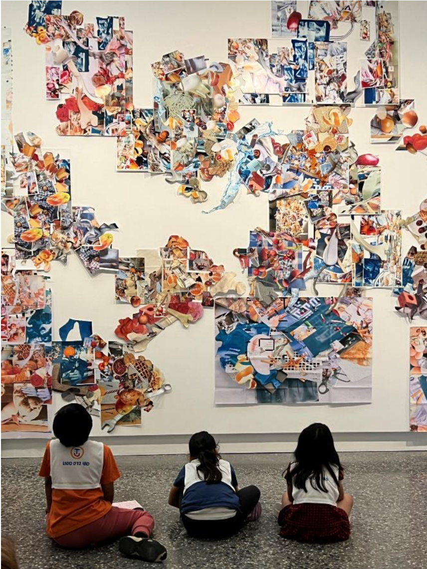
Left: students sitting in front of Skye Wagner's artwork Before Orange Peel, After Loose Teeth, Now Peanuts , 2023 in the National Photography Prize 2024.

All artworks are different. You may see paintings, photographs, videos and sculptures. Some of the works will be small, others may be very big! You will see art created by local artists and art by artists from around the world.