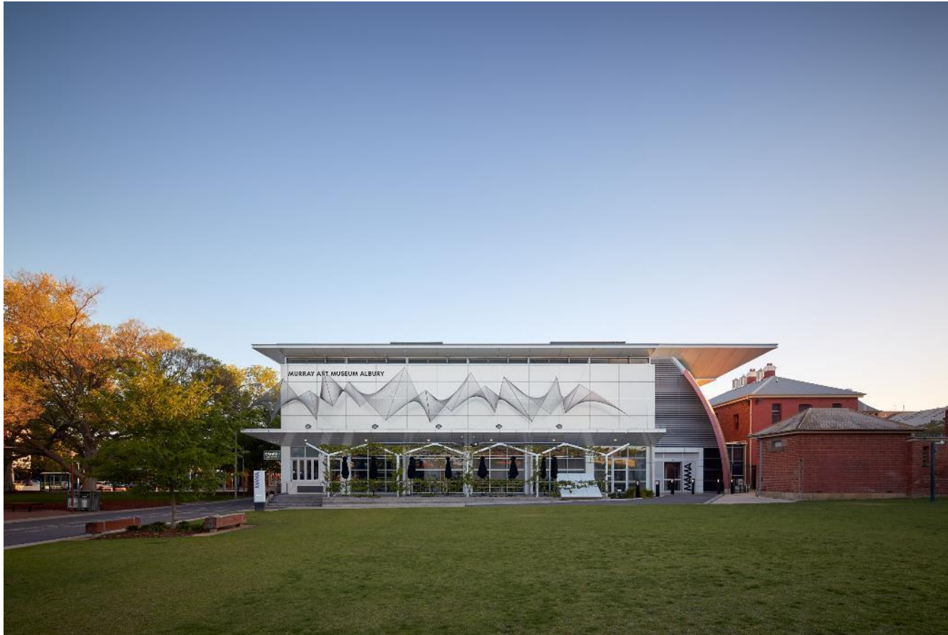
Left: view of the Museum from QEII Square.

This is what the back of the building looks like from QEII Square.