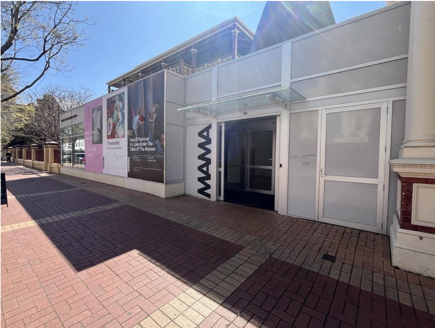
Left: the Dean Street Museum entrance.

We can enter the Museum through the front entrance on Dean street.