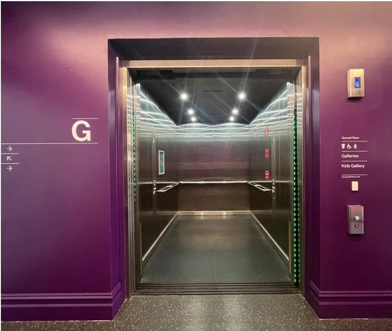
Left: the lift (doors open) on the Ground Floor.

This is what the lift looks like from the inside.