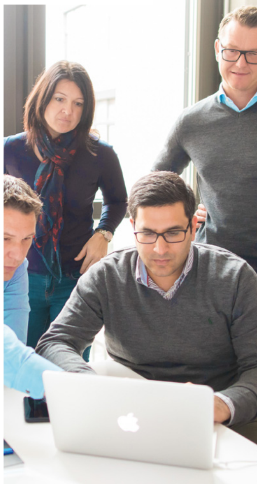
No 3 Practice-oriented knowledge