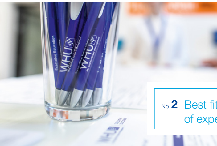
No 2 Best fit for your level of expertise