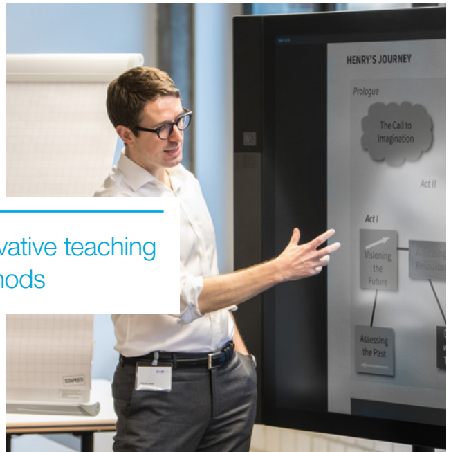
No 4 Innovative teaching methods