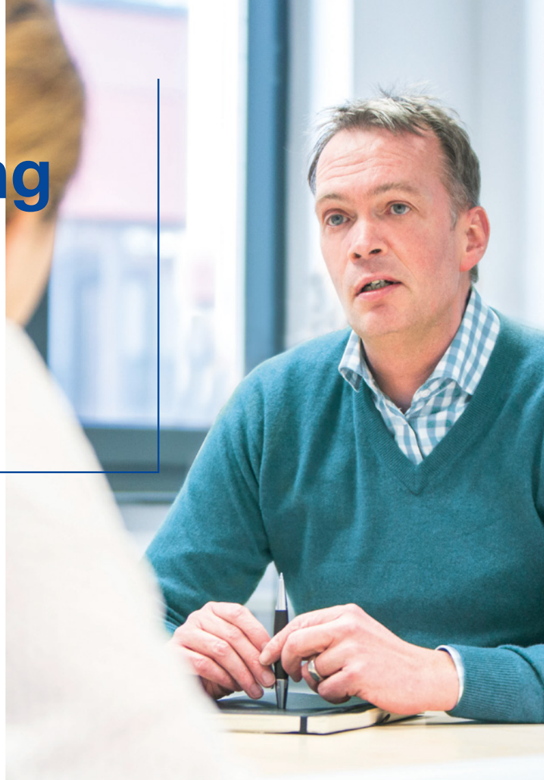
Hands-on, experiential learning through proprietary role-plays.

This program includes practical, hands-on advice on how to prepare negotiations strategically, how to position yourself, anticipate the moves of the other side, make the right choices, avoid traps, and deal with mental biases and power imbalances.