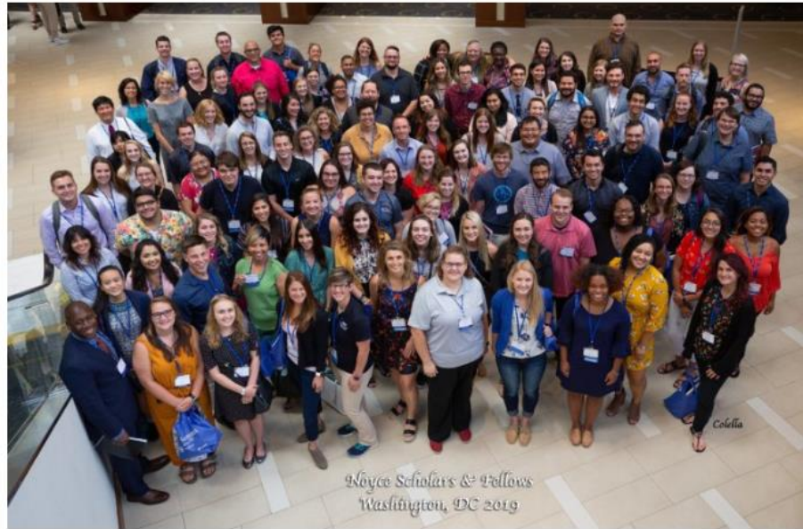
NOYCE SCHOLARS AND FELLOWS WERE AMONG THE OVER 600 ATTENDEES OF THE 2019 NOYCE SUMMIT IN WASHINGTON, DC – MICHAEL COLELLA