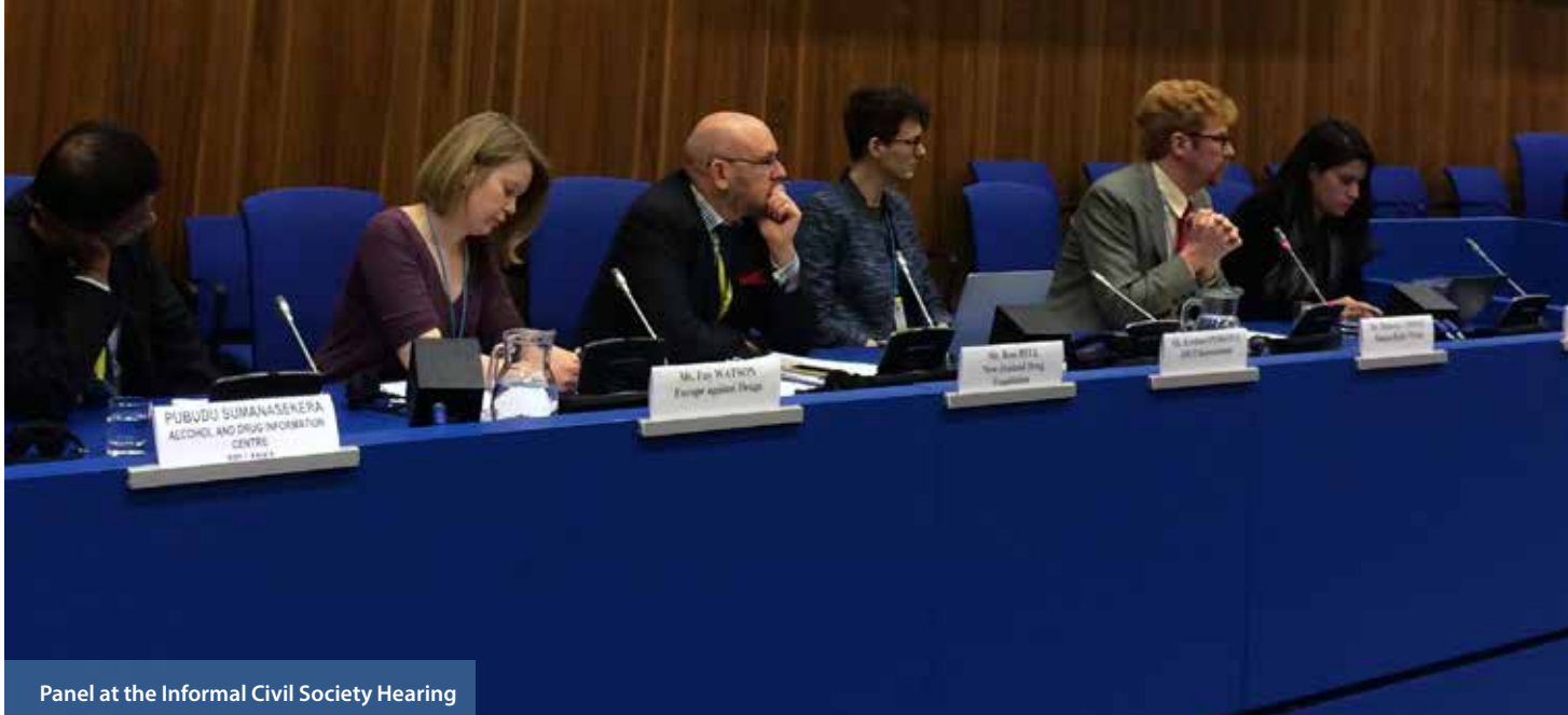
Panel at the Informal Civil Society Hearing

promoting global access to essential medicines, to protect the rights of the child, to engage drug users, recovered drug users, families and communities, to promote AD and proportionality of sentencing, and to abolish the death penalty. Participants included speakers selected by the CSTF (these speakers were the same as those nominated to participate in the UNGASS Segment interactive discussions), as well as other representatives from around the world. Detailed information about the Hearing is available on the CND Blog 46 or the UNODC website. 47