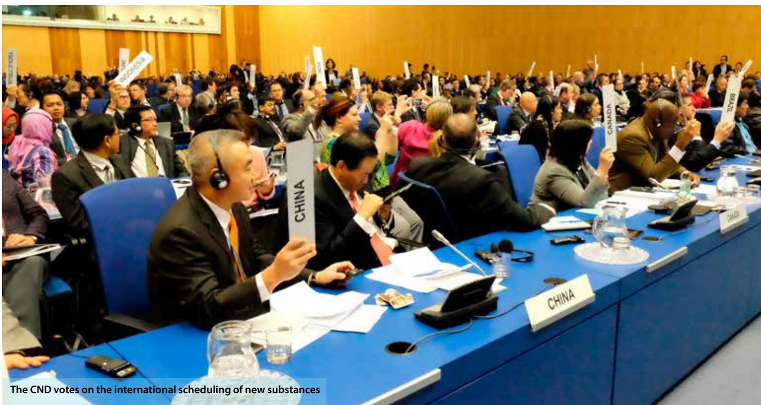
The CND votes on the international scheduling of new substances

Friday 13 th March began with a session on ‘Changes in the scope of control’. The morning’s deliberations had been keenly anticipated, as there had been lengthy discussions and disputes for several weeks prior to the CND with regard to China’s proposal to place ketamine under international