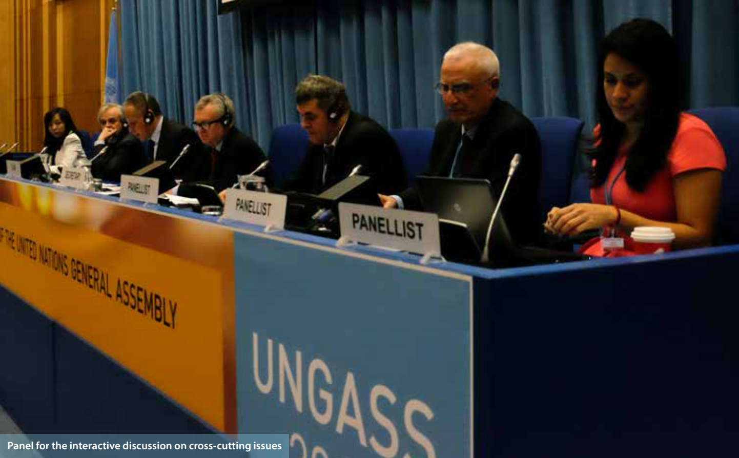
Panel for the interactive discussion on cross-cutting issues

based approach to addressing the world drug problem. Once again, however, how these would be applied proved to be a point of difference. This was despite the fact that, in the view of the Colombia representative, there should be 'no excluded subjects at UNGASS 2016'. As it was, some participants emphasised that innovative approaches could be applied within the treaty framework, referring to guidance provided by the 2009 Political Declaration and Plan of Action and the importance of the drug control conventions as the 'cornerstone' of the international drug control system. For example, referring to work of the Organization of American States (OAS), a US representative argued that incremental change is possible within the conventions. 'We can work together to build consensus and move forward without giving up on the basic drug control framework' he said. This was echoed by the South African contribution that urged that 'future policies shouldn't undermine the conventions'. Repeating that country's stance on the first day, a Mexican representative noted that, 'We must also consider and discuss the transnational effects of unilateral policies and measures, particularly those that explore regulation'. With the promulgation of such positions coming from member states, it was perhaps no surprise that it was left up to NGO participants to speak more directly to the elephant in the room: the issue of treaty reform, or modernisation.