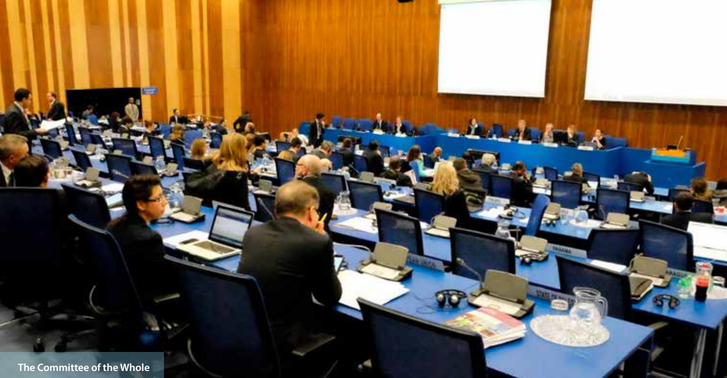
The Committee of the Whole

only then, discuss the WHO recommendation and consider additional arguments (economic, social, legal, administrative and other factors it may consider relevant') to either adopt, reject or deviate from the choice for the particular schedule recommended by the WHO. As spelled out in the Commentary on the 1971 Convention, however, if the WHO 'recommends in its communication to the Commission that the substance should not be controlled, the Commission would not be authorized to place it under control'. 33