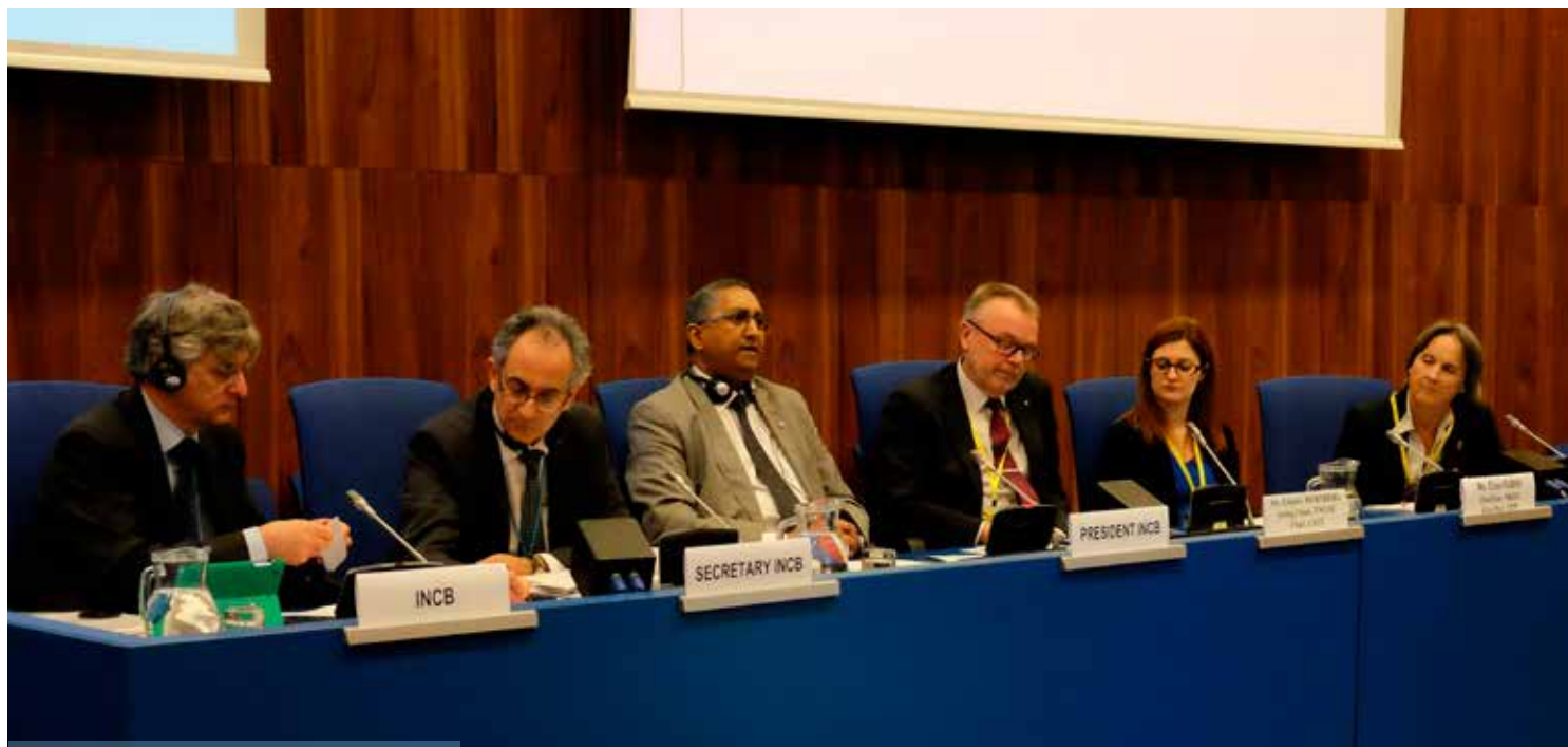
Informal dialogue with the INCB President

On the issue of access to essential medicines, he shifted responsibility to NGOs, arguing that problems encountered around shortages are due to ‘implementation at the domestic level’ and in