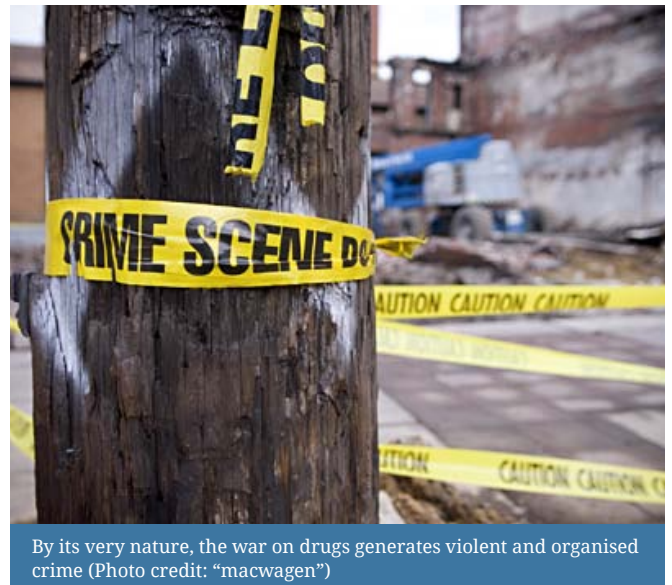
By its very nature, the war on drugs generates violent and organised crime