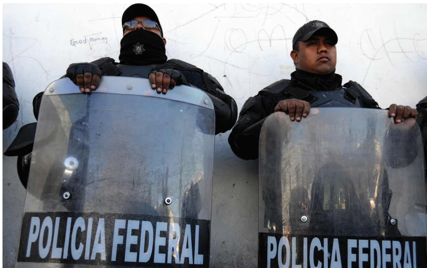
The enforcement-led approach to drugs has not succeeded in bringing about a sustained reduction in levels of crime or drug use

Finally, the UK Home Office suggests that criminalising users can lead to them accessing treatment through being arrested and drug tested. (65) Evidence from other countries, however, suggests the stigma and fear of arrest deter people from seeking treatment, and it is more effective to divert users into treatment without harming their future prospects with a criminal record for drug use. (66)