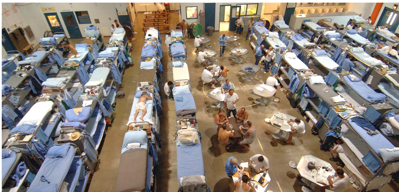
Current drug policies have led to spiralling prison populations

While the decriminalisation of drugs is sometimes portrayed as a libertarian approach, in fact drug laws criminalising possession for personal use are at odds with the law in most countries as it applies to comparable personal choices regarding sovereignty over one's body and freedoms regarding individual risk-taking decisions. These include freedom over what we eat, what medicines we take and how we consume legal drugs such as alcohol and tobacco, through to our sexual habits, involvement with dangerous sports or other potentially high-risk consensual activities.