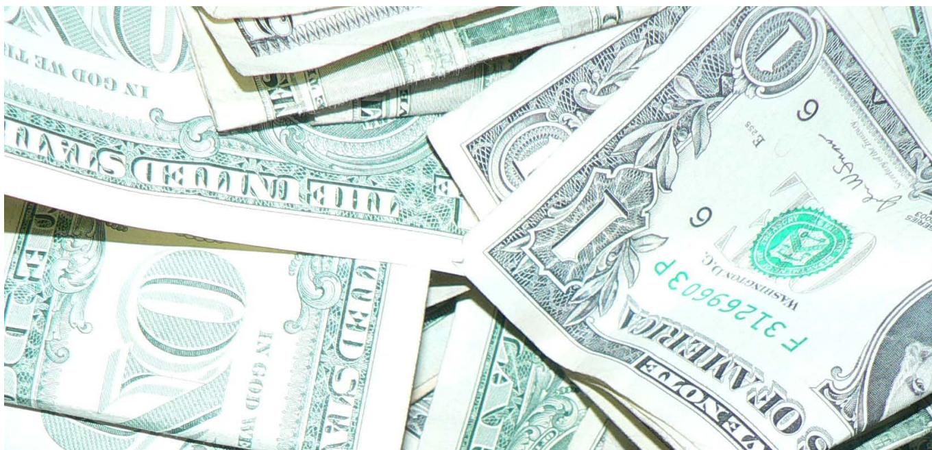
Despite its failure to achieve its stated aims, the war on drugs costs billions of dollars to enforce every year

offences, are often subject to cruel and unusual punishments including death threats and beatings; extortion of money or confessions through forced withdrawal without medical assistance; and various forms of cruel, inhuman and degrading treatment in the name of “rehabilitation”, including denial of meals, beatings, sexual abuse and threats of rape, isolation, and forced labour (55)