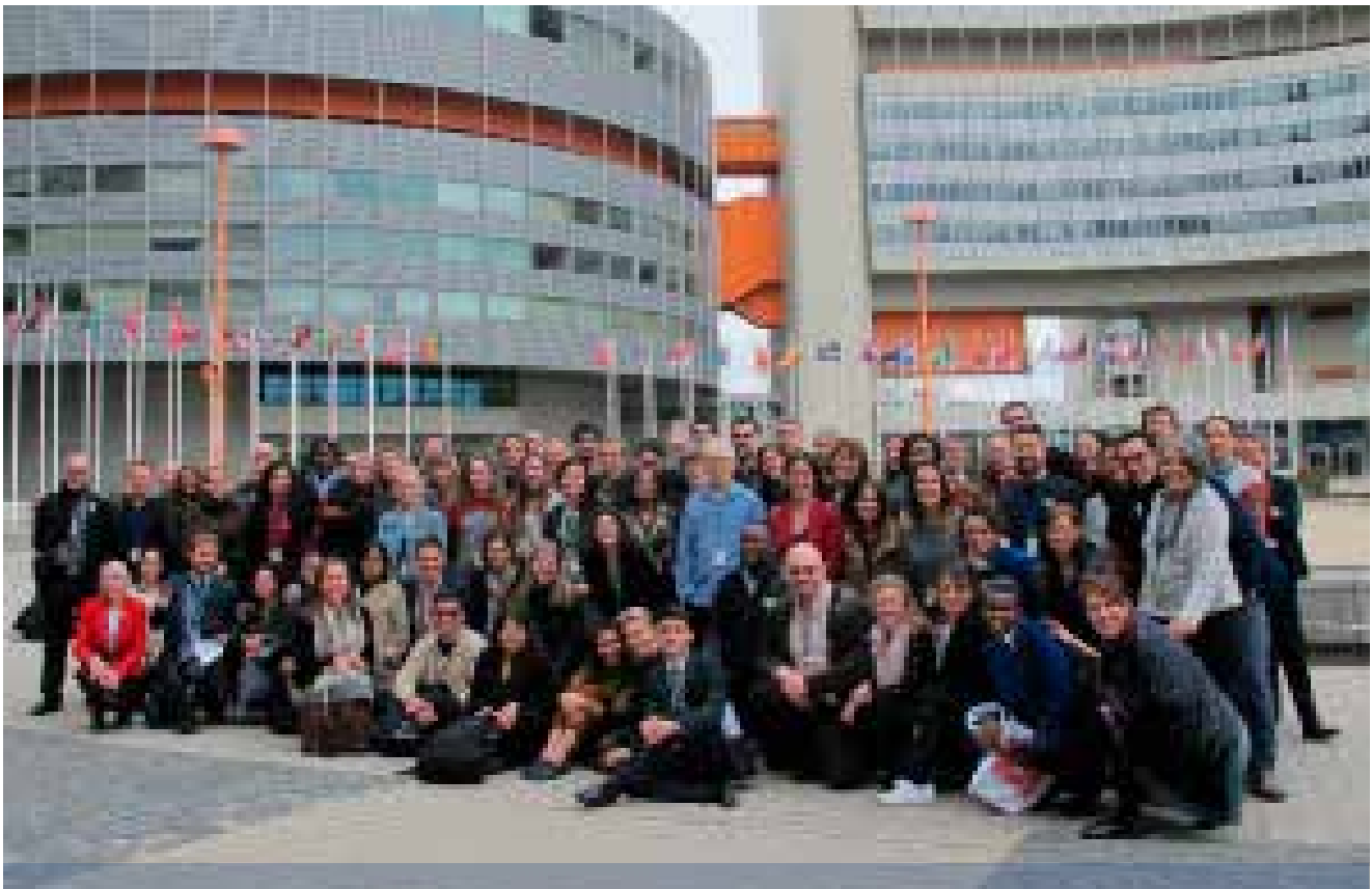
Civil society representatives gathered to take a family photo for the Support. Don't Punish campaign

adjusted downward. This represented a drop of USD 33 million to a total of USD 629.4 million.<sup>96</sup> As of December last year, the income projection reflected increased contributions from Mexico, Norway and Panama, and lower contributions from others in 2018.