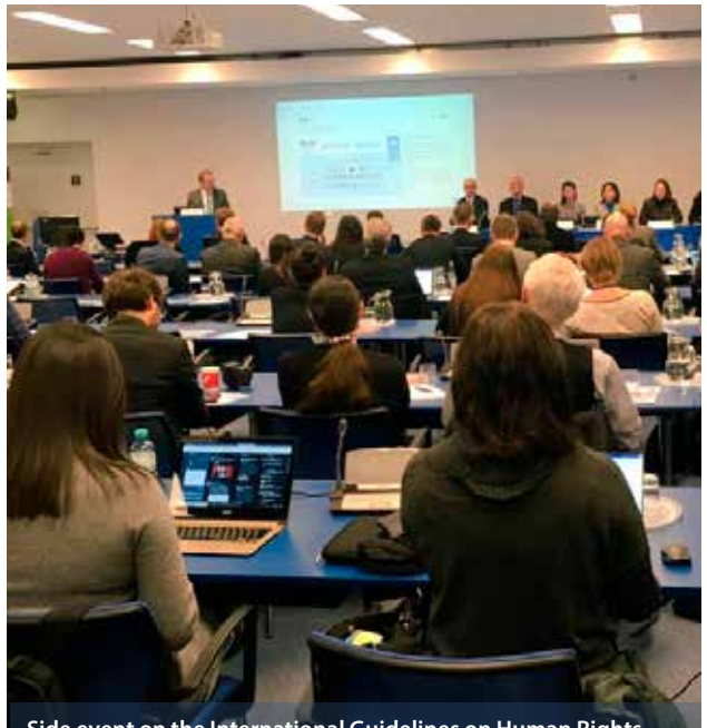
Side event on the International Guidelines on Human Rights and Drug Policy

Unsurprisingly, discussions within the regular