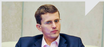
Ken Marti Vaher , former Minister of Interior, Member of Parliament, Estonia

“HIV epidemics and the prevalence of drug use in Estonia; it has not been an easy task for us in Estonia. It is a small society but we had a very large epidemic of HIV, big numbers of drug users. The harshness of problems pushed us to find good solutions and find resources. In 2003, we adopted the first strategy that introduced an evidence-based harm reduction approach. We also decriminalized drug use. In 2014 we adopted a comprehensive “White Paper” on Reducing Drug Use that validates main principles and values and sets clear goals for unified action.”