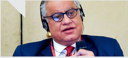
Anand Grover, UN Special Rapporteur on the right of everyone to the enjoyment of the highest attainable standard of health

“ If you want to stop police violence against women who use drugs, you should think about decriminalization. This is the way out. ”