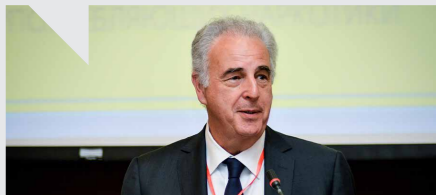
Michel Kazatchkine , UN Secretary General Special Envoy on HIV/AIDS in Eastern Europe and Central Asia

“There is strong and undeniable evidence that harm reduction protects people who inject drugs from HIV and improves their health, yet unjustly it remains unavailable to people in Eastern Europe and Central Asia. The Chisinau Forum allowed people who use drugs and decision makers to sit at the same table together to mutually reflect on the drivers of this disturbing harm reduction status quo in the region and how best to change it.”