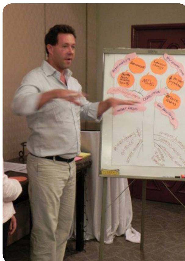
Example of 'tree of good drug policy' at civil society seminar in Manila, Philippines, December 2011