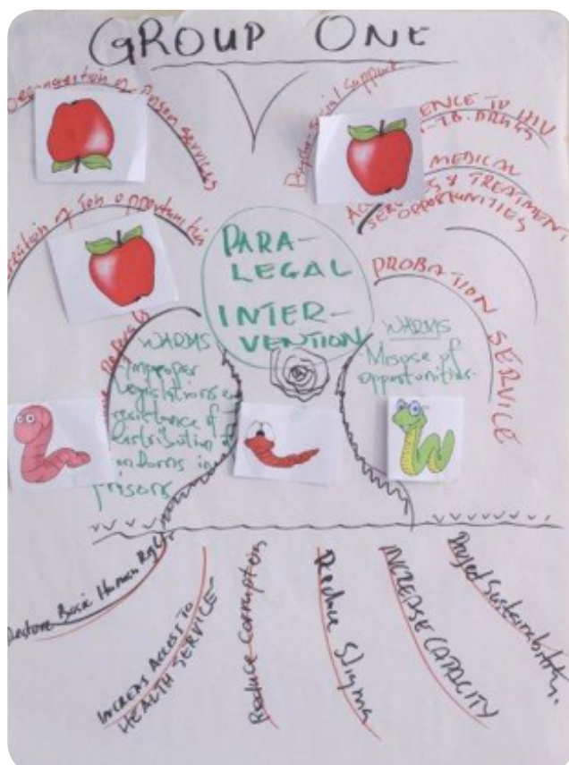
Example of 'tree of good drug policy' from civil society workshop in Nairobi, Kenya, November 2012