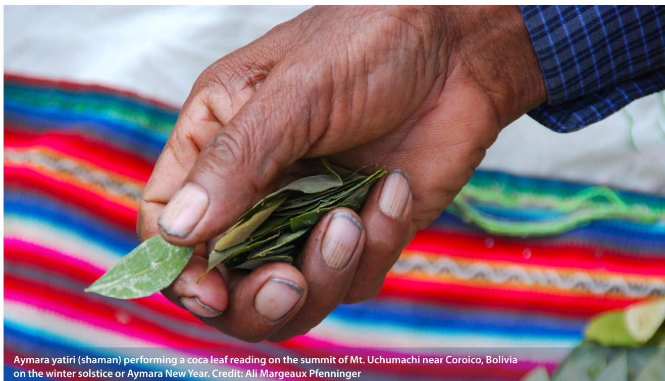
Aymara yatiri (shaman) performing a coca leaf reading on the summit of Mt. Uchumachi near Coroico, Bolivia on the winter solstice or Aymara New Year.

those would no longer be ‘narcotic drugs’ – it would remain in force for coca cultivation destined for cocaine production.