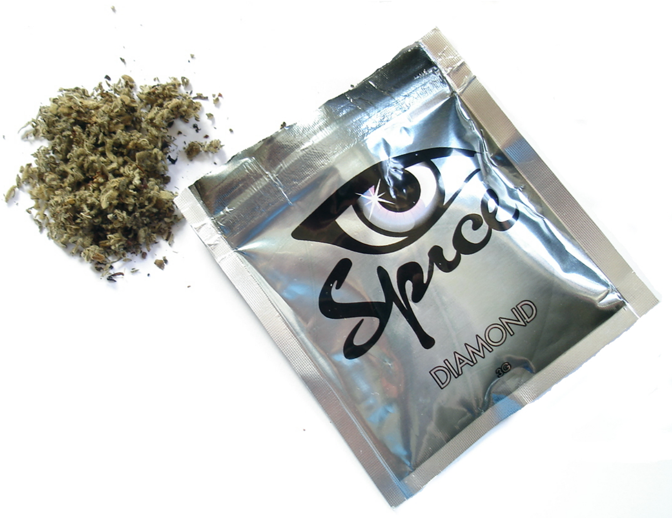
A product containing synthetic cannabinoids.

others have required the registration of “smart shops” in order to ban the distribution of NPS (Romania); while others again have drawn up generic lists of substances, in order to prevent the easy transformation of controlled substances into legal drugs (Hungary).