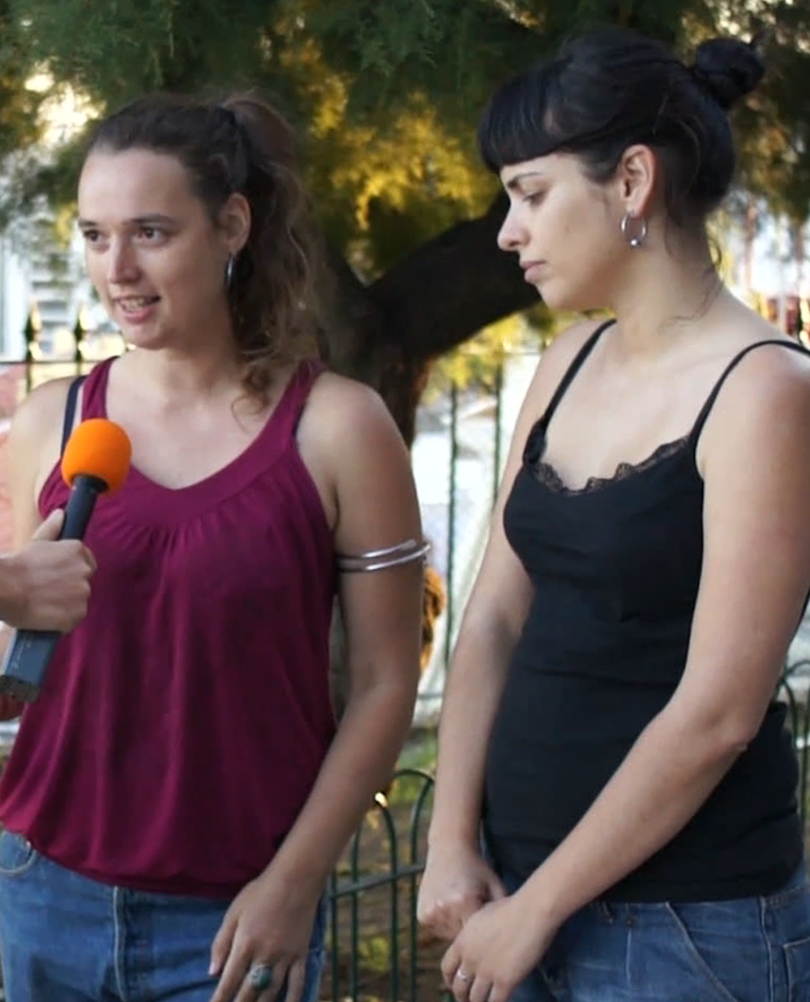
The HCLU Drugreporter interviews outreach workers from APDES, a Portuguese NGO in Lisbon. This agency targets party-goers with harm reduction information and tools. The Drugreporter produced a movie on the subject of the 10 years of decriminalisation in Portugal and on the innovative harm reduction services of the APDES NGO.