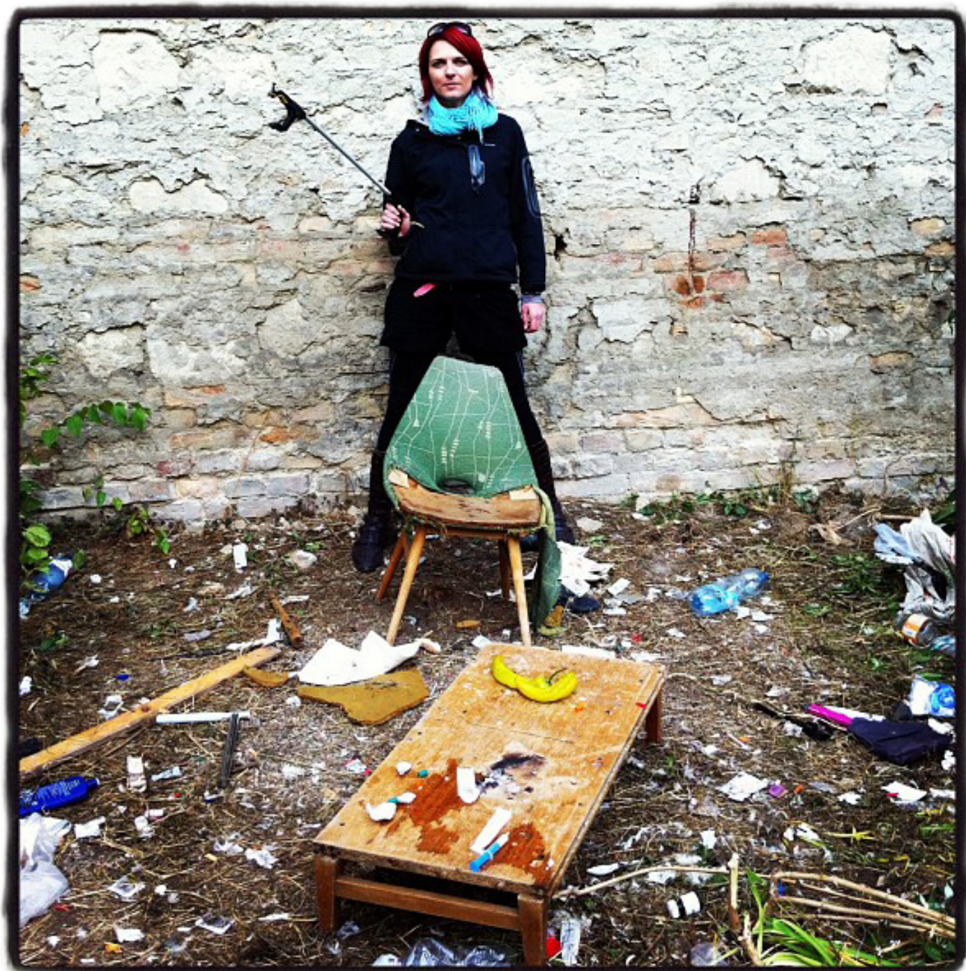
An outreach worker from the Blue Point needle and syringe program in Budapest collects needles abandoned by NPS users, who inject much more frequently than heroin users. For more information, see the HCLU Drugreporter's movie, " Budapest at the edge of an HIV explosion? "