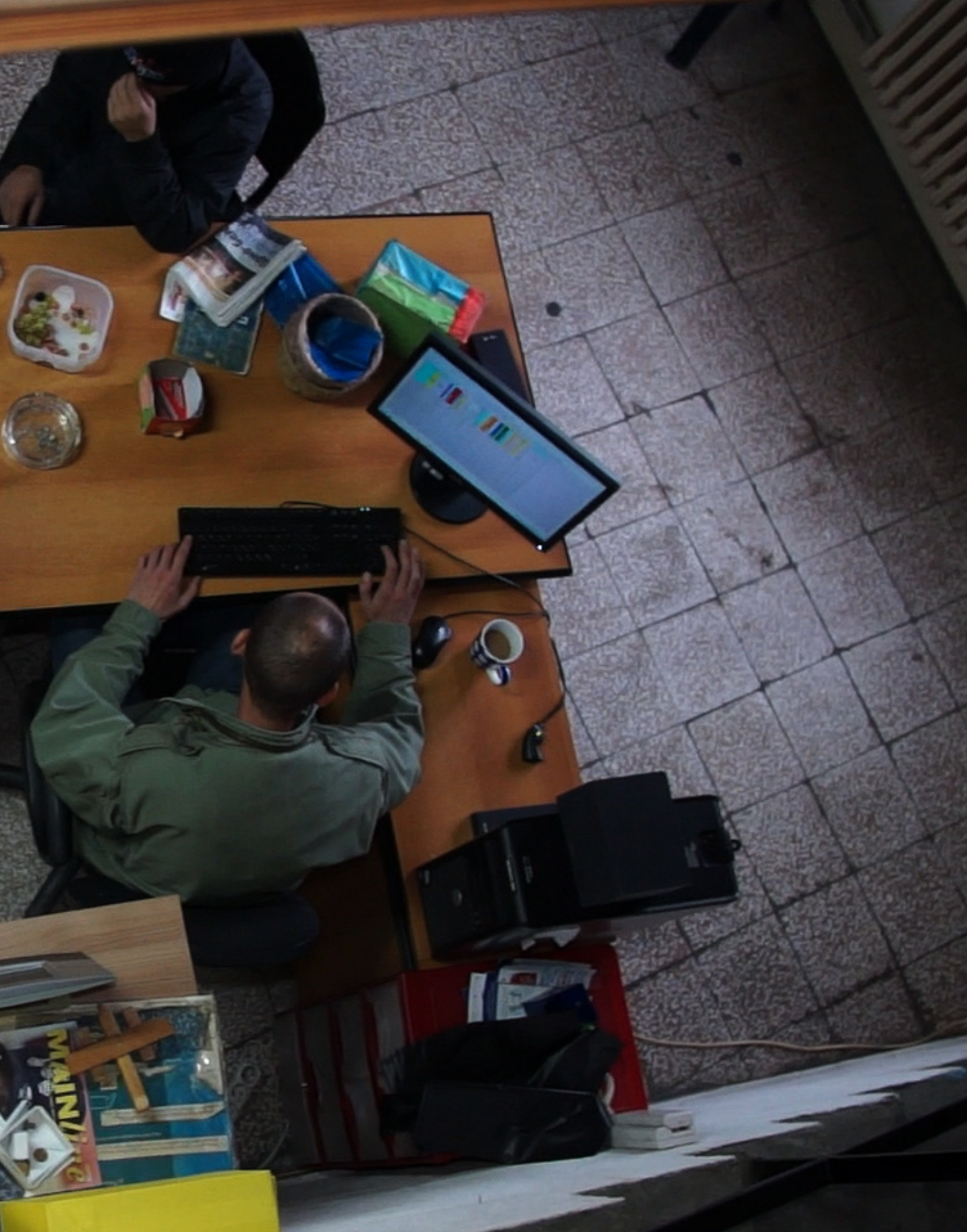
A needle and syringe program operated by the VEZA NGO in Belgrade, Serbia. Large-scale injecting use of stimulants has so far not been reported in Serbia.