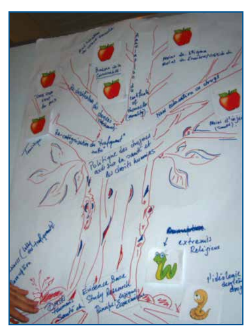
Example of "tree of effective and balanced drug policy" at civil society seminar in Mauritius, November 2013