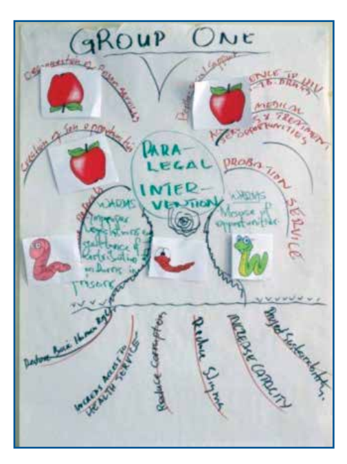
Example of "tree of effective and balanced drug policy" from civil society workshop in Nairobi, Kenya, November 2012

To facilitate the drawing of fruits and worms, the facilitator can bring preprinted copies of each to distribute to the participants see Annexes 2 and 3.