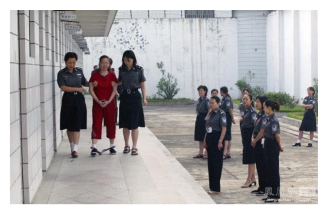
Guards "say a final farewell" to a woman who is about to be executed for drug trafficking. This photograph, which was taken in 2003, is one of few publicly available photographs from Chinese death row.

China classifies information on the death penalty as a state secret.<sup>679</sup> In fact, the state deems national-level data on the approval and execution of death sentences to be top secret, the highest possible level of secrecy.<sup>680</sup> State secrecy laws that govern the judiciary are vague and overbroad,<sup>681</sup> and unlawfully disclosing information about the death penalty may itself be a death-punishable offense.<sup>682</sup> As a result, it is impossible to gather comprehensive statistical data on the application of the death penalty in China.