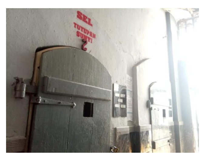
The door of a solitary confinement cell in Paledang Bogor Penitentiary, Indonesia, which holds women accused of capital drug offenses (pre-conviction).

Empirical research demonstrates, however, that the authorities routinely violate the right to effective counsel.<sup>417</sup> At the investigation phase, in fact, it is exceedingly rare for defendants to be afforded representation. The Institute for Criminal Justice Reform (ICJR) found that of 100 death penalty cases analyzed between 2017 and 2019, only 11 defendants benefitted from legal assistance at the investigation phase.<sup>418</sup> At trial, because most defendants accused of drug offenses cannot afford a lawyer, they receive the assistance of court-appointed lawyers, many of whom lack the training, resources, and experience to effectively represent them.419 In one case, the defense reportedly requested a sentence of death, against the client's wishes, and the court complied.<sup>420</sup> More common problems include, for instance, defense lawyers lacking gendersensitive awareness and advocacy strategies<sup>421</sup> and failing to call any witnesses, as occurred in the cases of multiple women currently on death row for drug offenses.<sup>422</sup> On appeal, "judges often fail to take the lack of effective legal counsel into consideration," even at the Supreme Court level.423