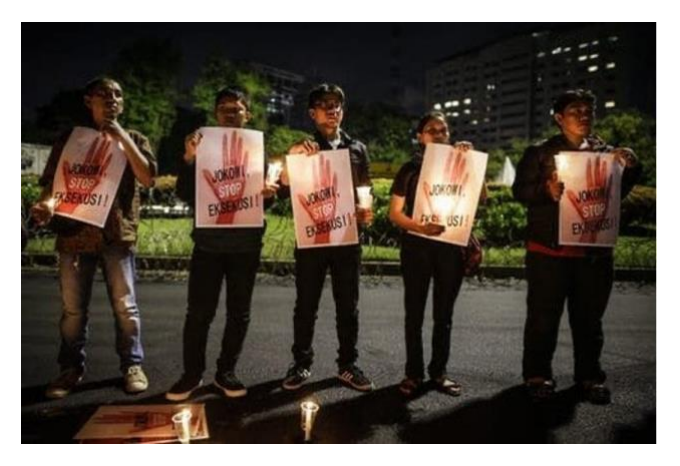
A protest against the executions in Nusakambangan in July 2016.

Between 2008 and 2013, there was an unofficial moratorium on executions in Indonesia.<sup>393</sup> In 2012, the country's first democratically-elected president, Susilo Yudhoyono, commuted the death sentence of a man, Deni Setia Maharwan, who had been convicted of drug trafficking.<sup>394</sup> In 2013, however, President Yudhoyono authorized the execution of five individuals, two of whom were foreign nationals convicted of drug offenses.<sup>395</sup> When Joko Widodo assumed the presidency in 2014 after campaigning on a platform of accountable governance and respect for human rights, many observers assumed the moratorium would resume.<sup>396</sup> Instead, within six months of taking office, President Widodo had authorized the execution of 14 people, all for drug offenses.<sup>397</sup> The next year he authorized four more executions, again for drug offenses.<sup>398</sup> President Widodo justified the executions by reference to Indonesia's high incidence of drug use, declaring the country in a "state of emergency."399