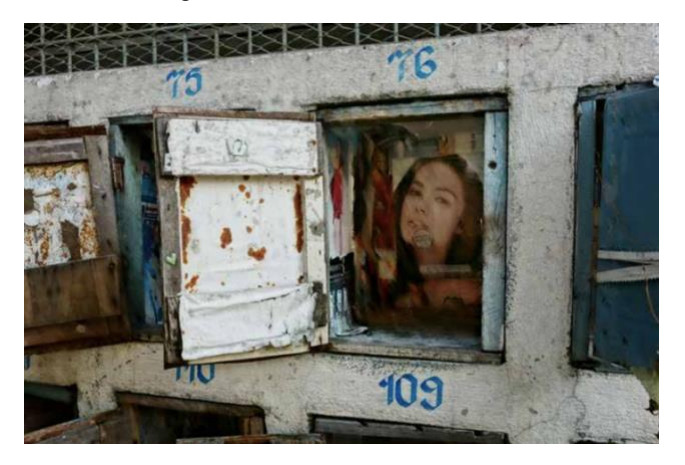
Empty locker at the abandoned women's prison in Chiang Mai, Thailand, in 2014.

Institute, has less than half a meter (1.5 feet) width of floor space for each incarcerated woman.<sup>658</sup> Incarcerated women often develop back and leg pain because they must sleep without moving onto their sides.<sup>659</sup>