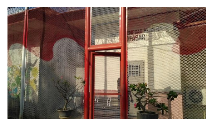
The gate to Denpasar Women's Penitentiary, Indonesia, where Lindsay Sandiford is currently incarcerated.

There are currently five women on death row for drug offenses in Indonesia.<sup>364</sup> In total, there are 11 women under sentence of death, so those convicted of drug offenses comprise 45% of women on death row.<sup>365</sup> Women represent a small minority of death-sentenced prisoners. The entire population of death row—including men—is estimated to be between 355<sup>366</sup> and 482<sup>367</sup> people. Approximately 60% of all death row prisoners are convicted of drug offenses.<sup>368</sup> Of the five women currently on death row for drug offenses, two are foreign nationals. At the time of their arrest, two were migrant domestic workers<sup>369</sup> and three had minor children.<sup>370</sup>