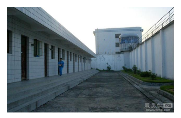
An incarcerated woman carries water to women who are about to be executed for drug trafficking so that they can wash their faces. This photograph, which was taken in 2003, is one of few publicly available photographs from Chinese death row.

In the China Judgments Online database, a keyword search for the terms "drug offense," "death sentence," and "female" returned over 600 cases. Almost all of these cases had been adjudicated since 2013, and the sample included those who had received suspended death sentences. (After two years, a suspended death sentence is reduced to an indeterminate life sentence<sup>700</sup> or a term of years if the person does not commit another offense while in prison.701 Exceedingly few suspended death sentences are converted into death sentences with immediate effect.)702 In partnership with the China University of Political Science and Law, we randomly selected and analyzed 300 of these cases. As commentators believe that the SPC publishes cases "selectively," this is most likely not a representative sample.<sup>703</sup> Nevertheless, we have identified some broad themes that emerge from the cases.