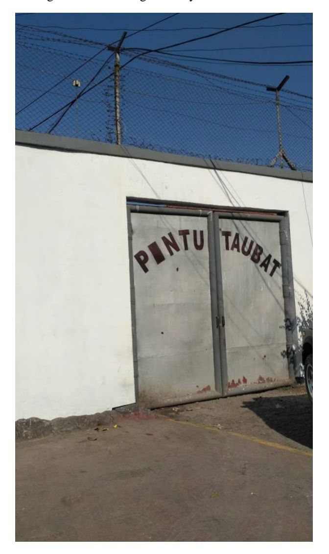
The gate of Surabaya Class I Detention Centre. Pintu Taubat means "The Door of Repentance." This prison is located in East Java, Indonesia, and holds women accused of capital drug offenses (pre-conviction).

defendants surveyed had experienced torture.<sup>425</sup> Komnas HAM (the National Commission on Human Rights) found that an even higher proportion of death row prisoners (23 of 56, or 41%) reported experiencing torture at the hands of the police.<sup>426</sup> Research suggests that courts continue to admit evidence obtained as a result of torture, such as coerced confessions, including in capital cases.<sup>427</sup> At least two of the women currently on death row for drug offenses report having been tortured by police: one woman experienced sexual violence in pre-trial detention, and Merri Utami was threatened and beaten during the investigation process, leaving wounds covering her body.<sup>428</sup>