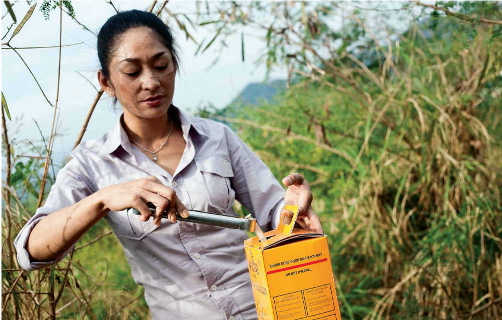
A peer educator in Viet Nam collects used needles to reduce risk to other people.