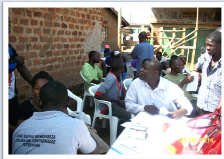
A Health worker from MARPI Mulago testing a Drug User

The HCT activity attracted over two hundred drug users (200) but only one hundred (100) were tested and given six cartons of Condoms due to limited HIV testing kits. Those who were not tested were referred to MARPI Mulago Hospital. The exercise was appreciated by many drug users. However, some asked for other testing's like cancer screening, syphilis, ghonorria, TB, Hepatitis and their treatment which were not on the program. These were referred.