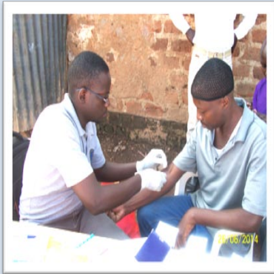
A Health worker testing a Drug User

"Our Lives begin to End the Day we Become Silent About things that Concerns Us"