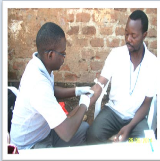
A Health worker from MARPI Mulago testing a Drug User