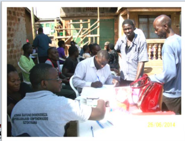
MARPI health workers running the VCT

partnership with MARPI Mulago under the ministry of health