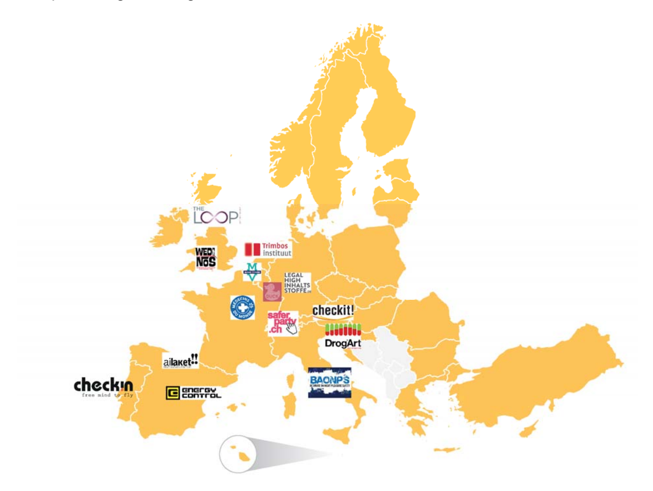
Figure 1 European drug-checking services in existence in 2017