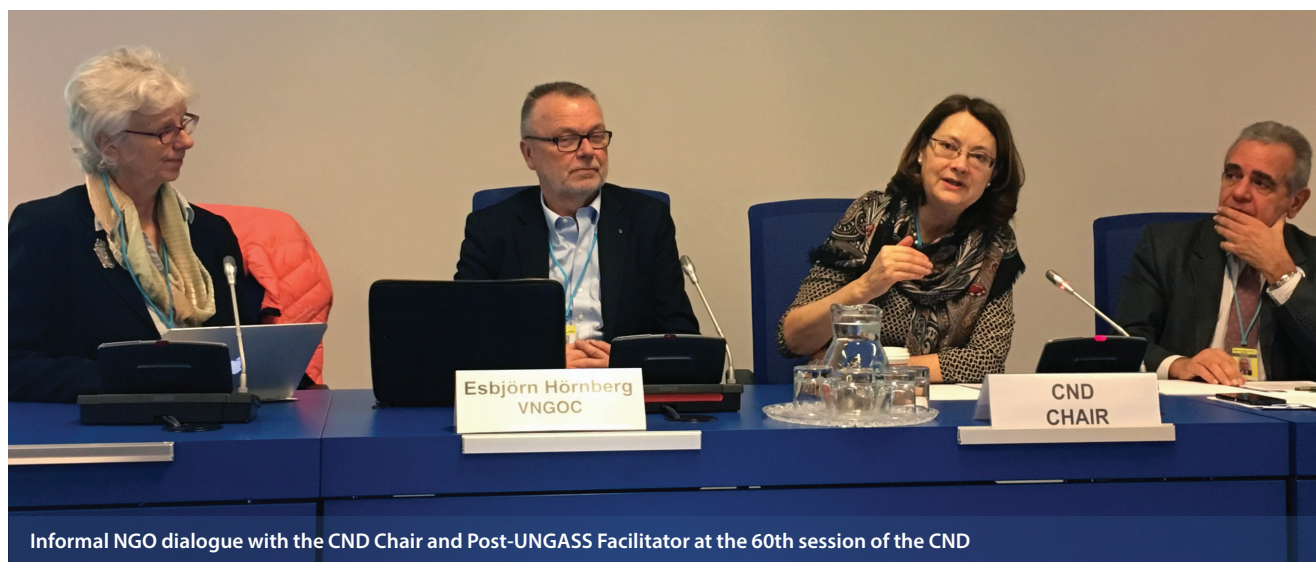
Informal NGO dialogue with the CND Chair and Post-UNGASS Facilitator at the 60th session of the CND

as examples of greater coordination, the recent participation of the Commission on the Status of Women at a special event organised at the CND Reconvened Session in December, 77 as well as the participation of WHO, UNAIDS, OHCHR, UNDP and UN Women in the post-UNGASS implementation process. Resource constraints, she continued, was another reason for more coordination to avoid duplicating work.