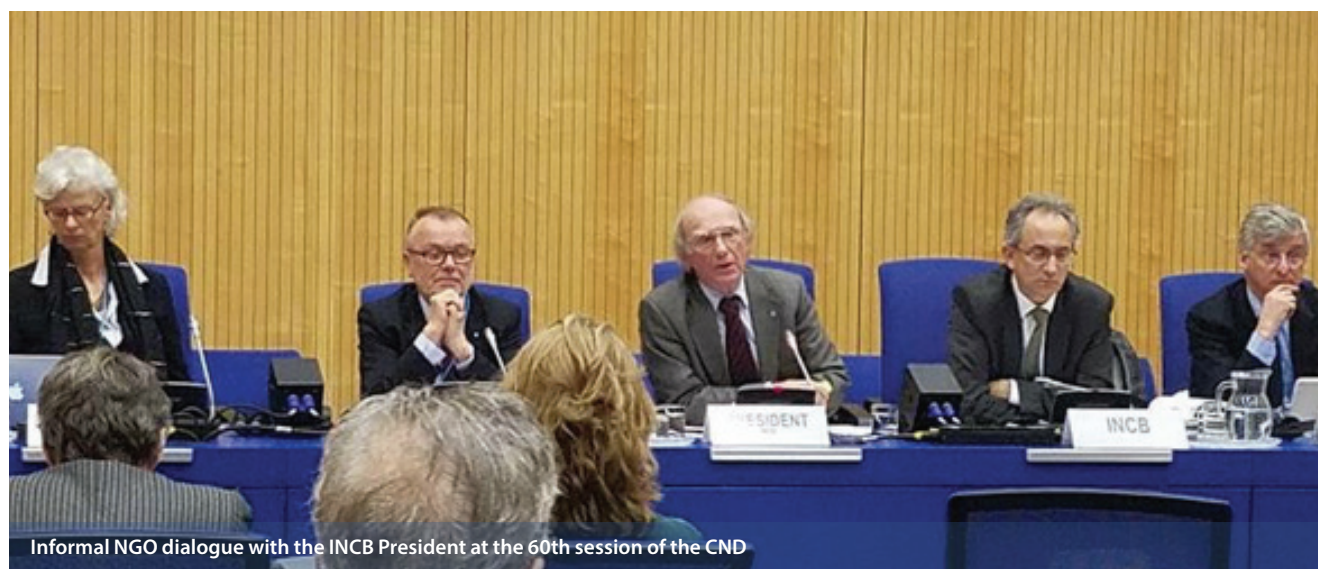
Informal NGO dialogue with the INCB President at the 60th session of the CND