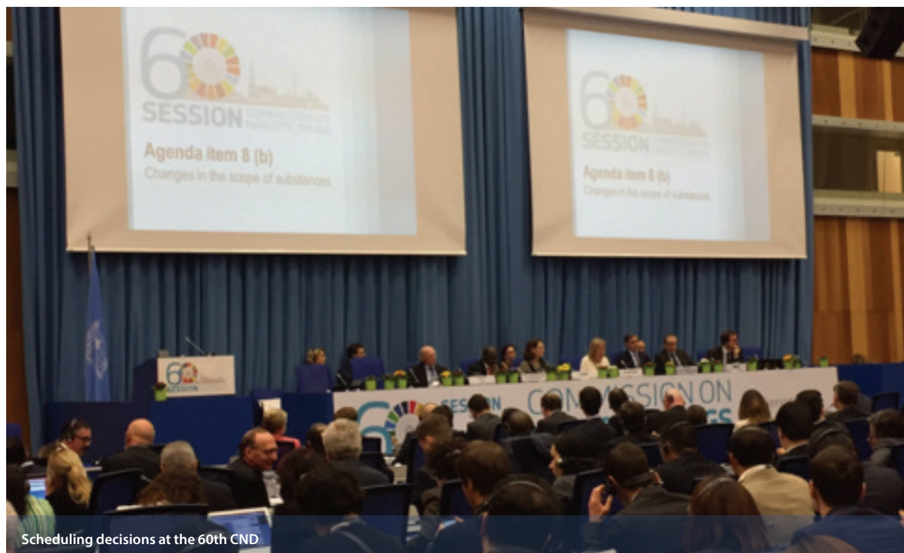
Scheduling decisions at the 60th CND

HIV ), and had support from Iran and Pakistan, but numerous other countries resisted this proposal (including Australia, the Netherlands, the USA, the UK and France). Attention also focused on the new precedent of calling for funding for one specific part of UNODC, rather than for the Office as a whole (with Pakistan eventually 'willing to be flexible on this' – as long as such flexibility was reciprocated in the future!). Overall, however, the text progressed through the CoW with much less rancour than expected, and was eventually sponsored by Andorra, Australia, Brazil, Colombia, Costa Rica, Ecuador, Guatemala, Israel, Liechtenstein, Malta (on behalf of the 28 EU member states), Switzerland, Togo, Tanzania, the USA and Uruguay, as well as Norway. Interestingly, in the final moments before adoption in the Plenary, the USA asked for the reference to the UN technical guide on harm reduction to be the 2009 version 39 rather than the revised 2012 version (which is noteworthy, as the 2012 document is more explicit on the decriminalisation of drug use and overdose prevention). 40