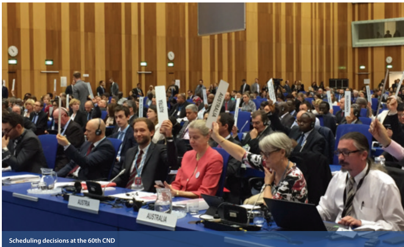
Scheduling decisions at the 60th CND

and all the substances were assigned according to the WHO's recommendations (See Box 3 on CND decisions, including those relating to scheduling).