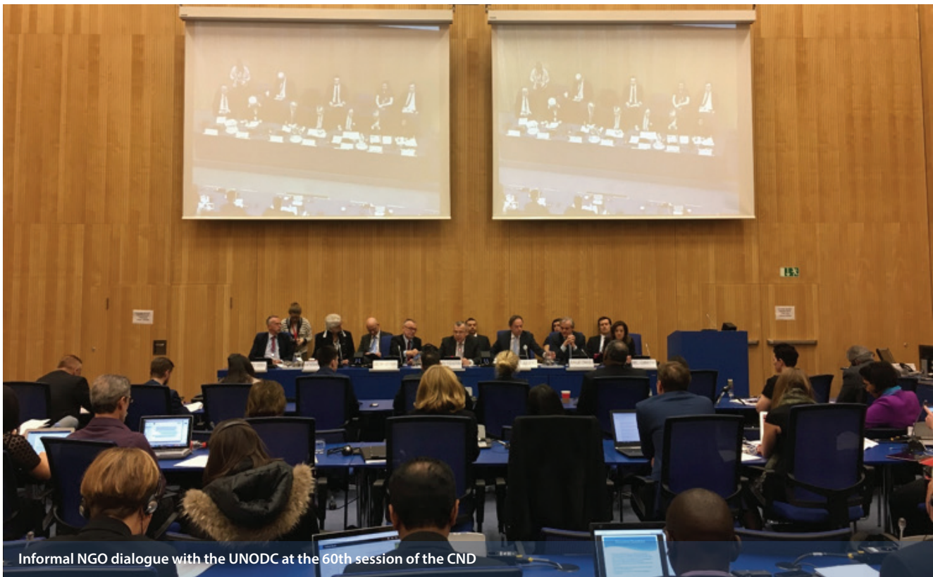
Informal NGO dialogue with the UNODC at the 60th session of the CND