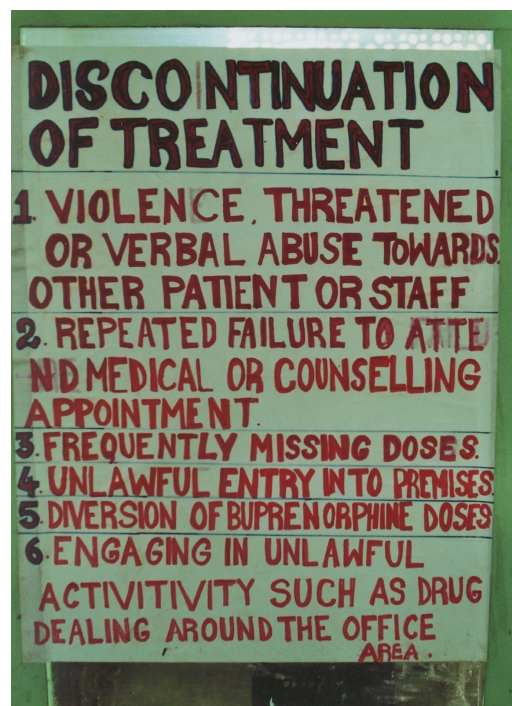
Rules at the SASO drop-in centre in Imphal

Eventually the very high prevalence of HIV/AIDS infections among IDUs and the fear that it would spread to the general