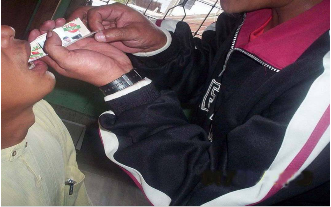
Dispensing buprenorphine

In 1985 the Ministry of Social Justice and Empowerment drafted a scheme for prevention of substance abuse, subsequently revised in 1994, 1999 and 2008. The demand-reduction strategy consists of education, treatment, rehabilitation and social integration of drug users to prevent drug abuse. It is meant to give financial support to NGOs to help implement these aims. 28