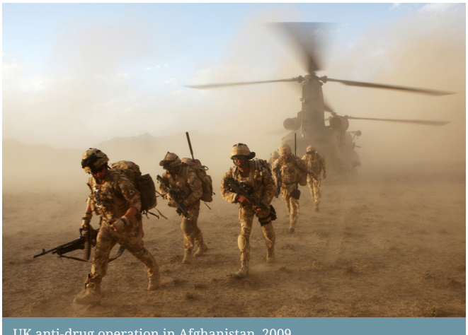
UK anti-drug operation in Afghanistan, 2009

So, as the two conventions clearly articulate, there are in reality two distinct drug wars being fought, in parallel. The first is the fight against addiction, which criminalises those who use, supply or produce certain drugs for non-medical purposes.