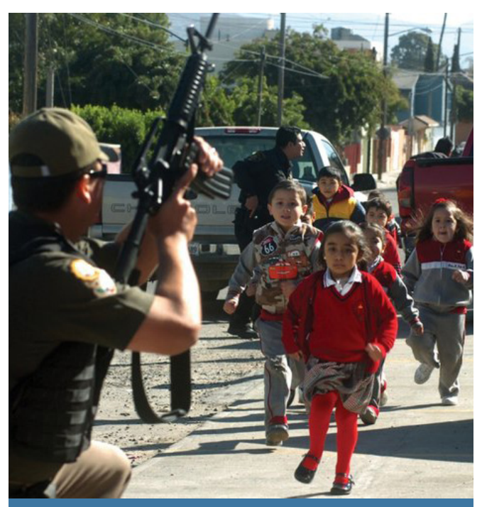
Schoolchildren fleeing drug-related violence in Tijuana, Mexico

Throughout Latin America, but also in Central Asia and West Africa, long-running civil wars and decades of poor governance have been exacerbated by the war on drugs. An estimated 95% of illicit drug production occurs in such areas, and trafficking from and across them is made easier by their chaotic environment.<sup>22</sup>