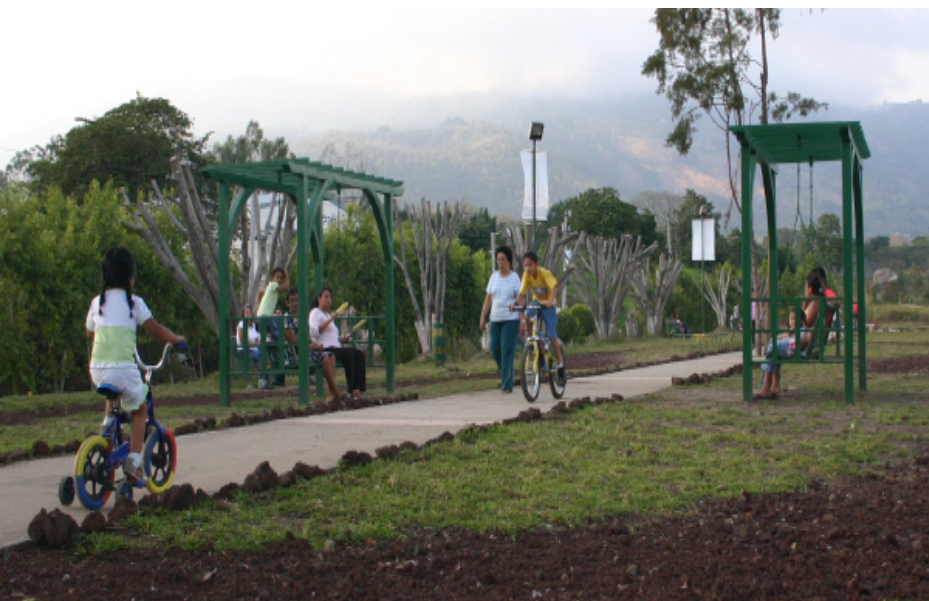
Parque de la Convivencia (Community Coexistence Park), one example of "recuperating" public space in Santa Tecla.

In 2008, a municipal management mechanism was inaugurated to coordinate violence prevention activities. This mechanism brought together the main local, state, and national actors responsible for services pertaining to citizen security to coordinate their activities in alignment