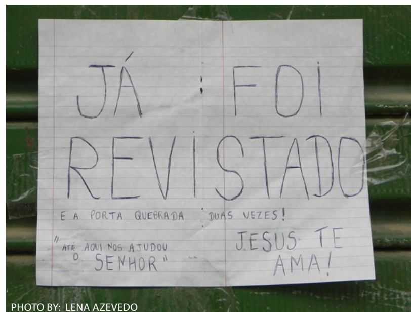
“ALREADY BEEN SEARCHED...and the door broken twice” reads a note left by a resident in Complexo do Alemão, imploring police not to break in again.

Despite these obstacles, the UPP seems to be relatively well received. A recent study interviewed residents in eight favelas with UPP and found 83% characterizing their community's security situation as “better” or “much better” compared to a year before, and 72% saying