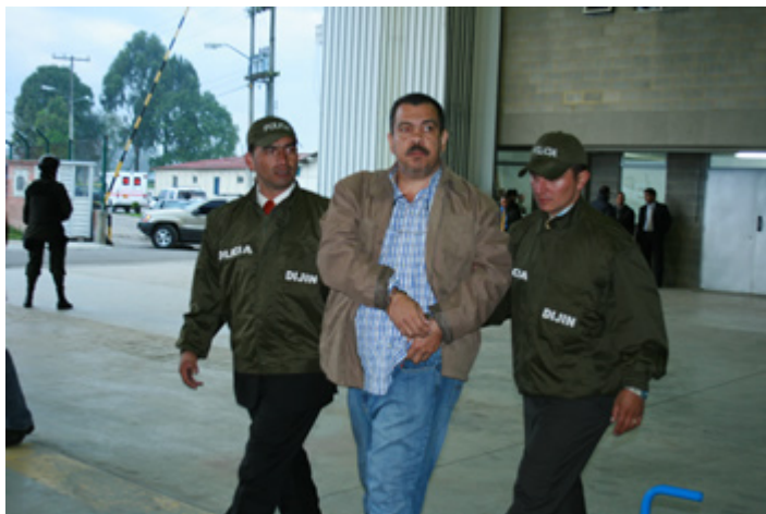
Diego Fernando Murillo alias Don Berna, upon his May 2008 extradition to the United States.

government encouraging him to collaborate, Don Berna ordered his men to use the least possible violence. Some critical analysts used the term “DonBernabilidad”—a play on the Spanish word for governance—to describe what they saw as the main driver of the Medellín Miracle.