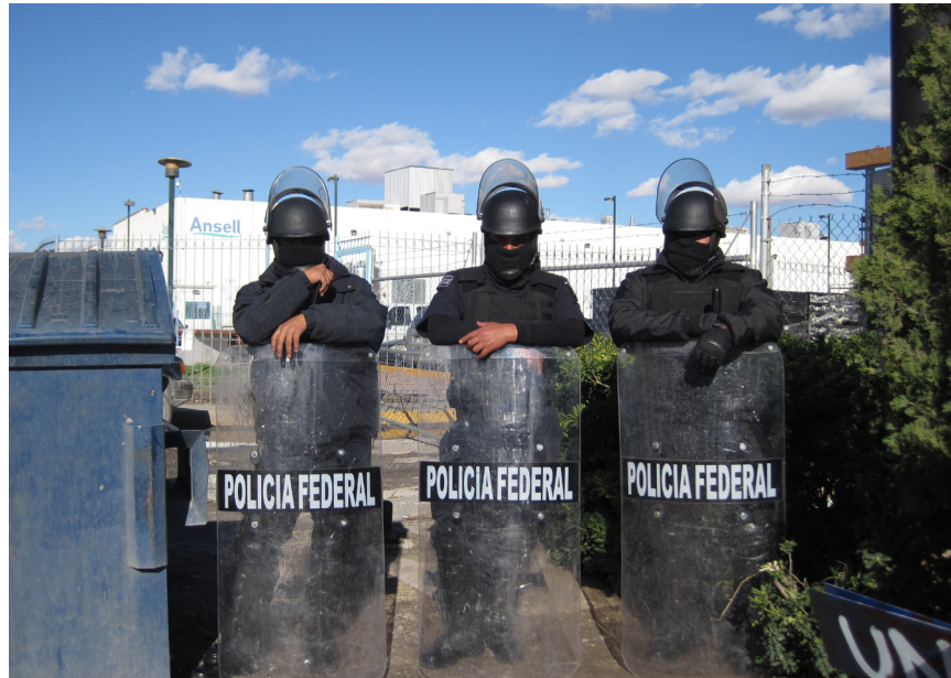
Federal Police in Ciudad Juárez, Mexico

In evaluating the "Todos Somos Juárez" program, the ongoing violence speaks volumes. At the end of 2010, the murder rate stood around 230 per 100,000 residents. There were at least 800 drug-related murders in the city in the first four months of 2011. Several incidents have shown the security risks Juárez residents continue to face as they go about their daily lives. In a tragic irony, on January 23, 2011, seven soccer players and fans were gunned down by an armed group of individuals before the match began; the field had recently been constructed with funds from