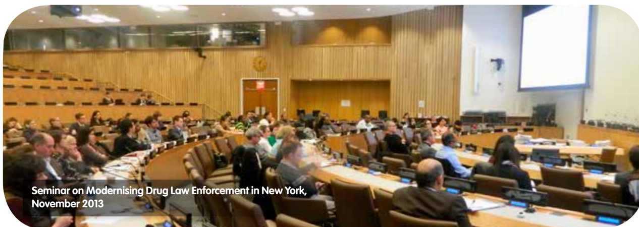
Seminar on Modernising Drug Law Enforcement in New York, November 2013