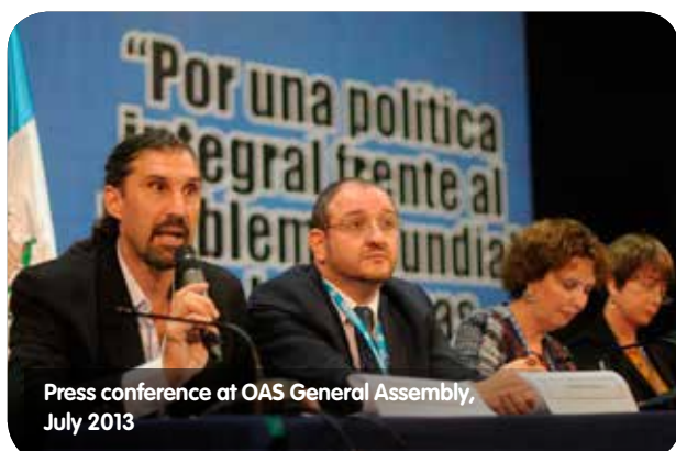
Press conference at OAS General Assembly, July 2013

IDPC continued to participate in national-level debates, especially through the collaborative Community Action on Harm Reduction 42 and Asia Action on Harm Reduction 43 projects through meetings, seminars and roundtables on key drug policy issues involving NGOs (including people who use drugs), academics, policy makers and UN officials in the region, in particular in Thailand, China, India, Vietnam and Malaysia. We also conducted a series of workshops to strengthen the capacity of civil society to engage in national and regional drug policy advocacy.