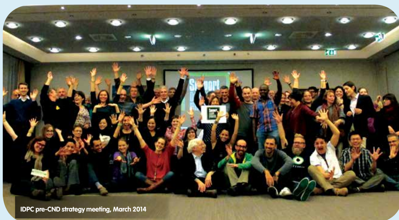
IDPC pre-CND strategy meeting, March 2014