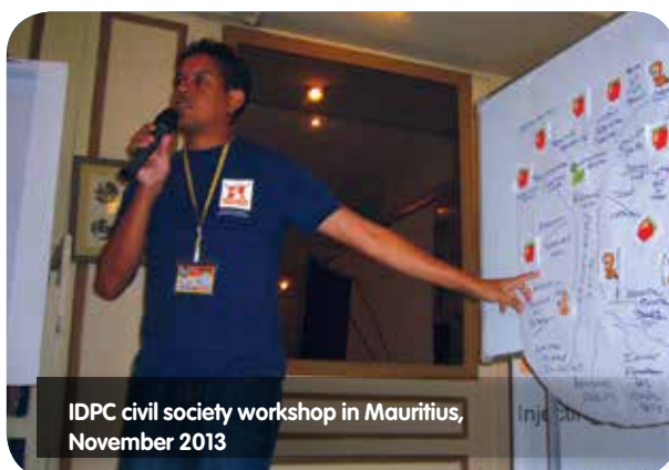
IDPC civil society workshop in Mauritius, November 2013

The toolkit 77 was launched in June 2013 at the International Harm Reduction Conference in Vilnius. Drafted in collaboration with EHRN, its objective is to build the capacity of civil society organisations for influencing drug policy making processes at national, regional and international levels. The IDPC toolkit can be used as an "off the shelf" document by anybody wishing to deliver training and workshops on drug policy advocacy to their civil society partners and members. It is intended as a comprehensive menu of activities and content from which a facilitator can pick and choose the ones which best suit the context, audience and timeframe. The Toolkit includes modules on the current drug control system, drug policy reform, harm reduction advocacy and civil society advocacy. So far, IDPC has used the toolkit as a basis for trainings in Kenya, Malaysia, Mauritius, Indonesia, Lebanon, Ljubljana, the Philippines, Poland, Thailand, Tunisia and the UK.