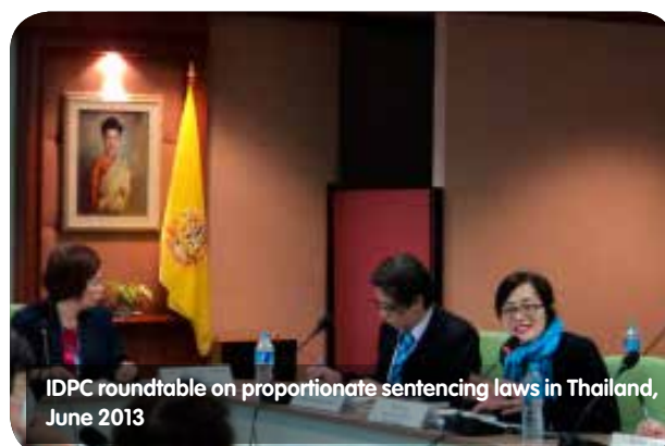
IDPC roundtable on proportionate sentencing laws in Thailand, June 2013