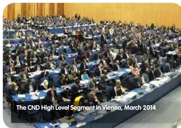
The CND High Level Segment in Vienna, March 2014

civil society engagement. After the Statement was adopted, a group of 58 like-minded countries submitted an interpretative statement to condemn the use of the death penalty. 9