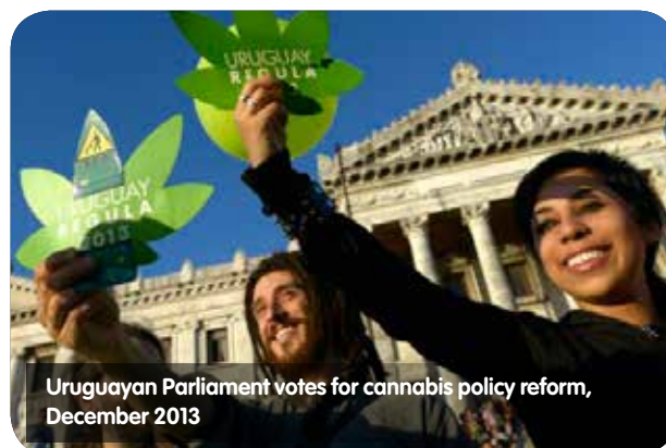
Uruguayan Parliament votes for cannabis policy reform, December 2013

IDPC also continues to engage at regional level at the Inter-American Observatory on Drugs (CICAD), the Union of South American Nations (UNASUR) 35 and the Cooperation Programme on Drug Policies between Latin America and the European Union (COPOLAD). 36 For the first time, in 2013 IDPC started working closely on the issue of women and incarceration for drug offences in Latin America. We produced a briefing paper 37 on the issue which was presented at various key seminars and conferences across the Americas, in collaboration with the Inter-American Commission on Women (CIM).