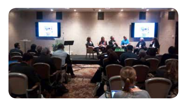
Senior Level Policy Dialogue