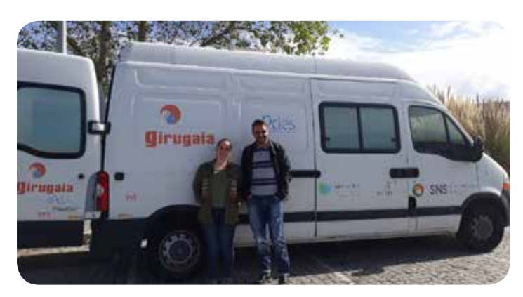
Cooperation with Portugal