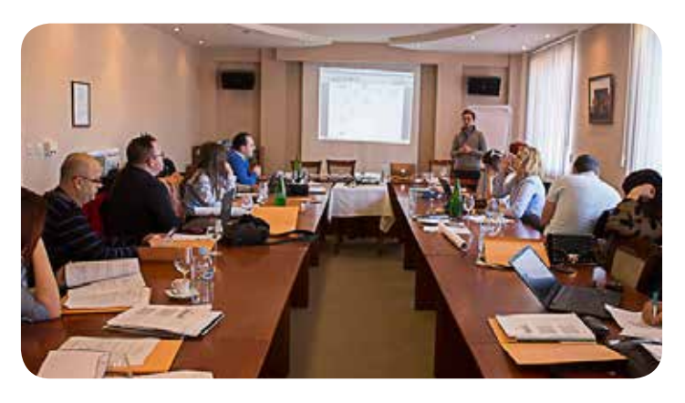
Regional training on budget advocacy and monitoring