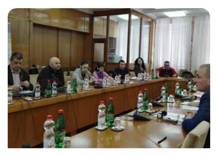
DPNSEE General Assembly