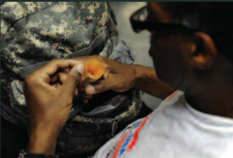
A US military veteran prepares to take his medication at Central Union Mission, in Washington, DC, which provides shelter for homeless men, on November 28, 2011.

But implementing evidence-based responses to drug dependence is a matter of human rights as well as public health. These are principles that apply to all people regardless of whether they have served in the nation’s military. The VA provides the three models highlighted here to veterans, but they are essential for all who are drug dependent and may be at risk of overdose, in need of treatment or without a home. By expanding and sustaining these programs the Veterans Administration can set a precedent that ultimately could be a significant contribution to protecting the right to health not only for veterans but for all Americans.