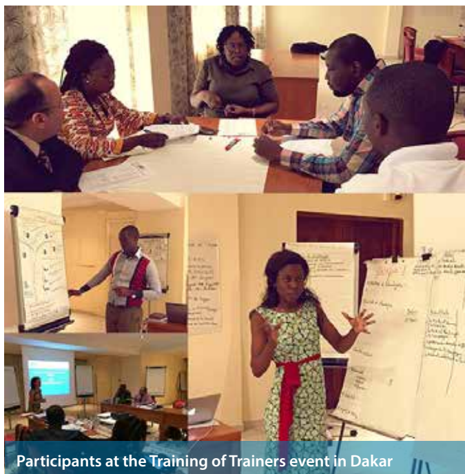
Participants at the Training of Trainers event in Dakar

The event showcased the growing interest for such trainings (with more than 90 applications received), as well as the success of this new capacity building model which IDPC hopes to replicate in the future, in partnership with other NGO partners.