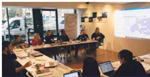
Kick-off meeting of the Harm Reduction Consortium, January 2019, London