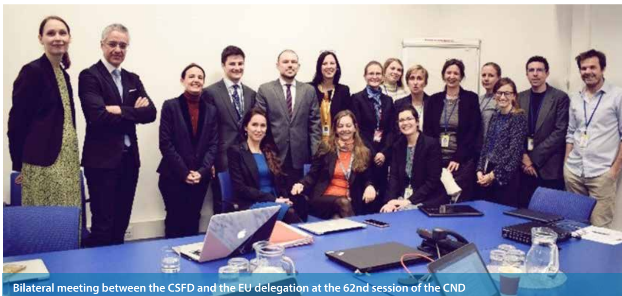
Bilateral meeting between the CSFD and the EU delegation at the 62 nd session of the CND

The 62 nd session of the CND was particularly important for the reform movement as UN member states met to take stock of the past ten years of global drug control and define what would come next. Unsurprisingly, almost 500 NGOs were in attendance at the CND and its Ministerial Segment held from 14 th to 22 nd March 2019.