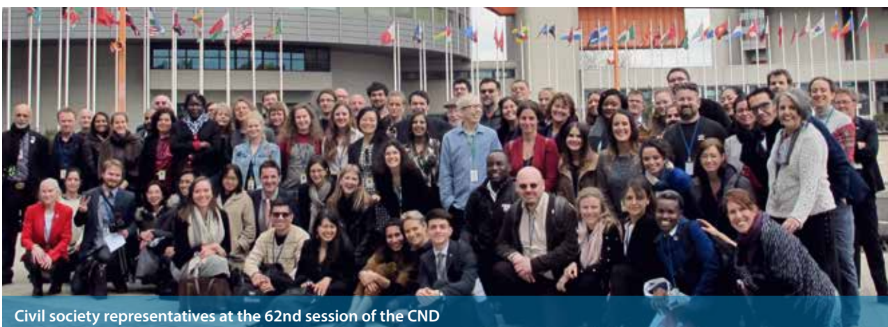
Civil society representatives at the 62nd session of the CND

A significant number of responses highlighted promising cannabis-related reforms . These included the coming into effect of the legal regulation of adult use (e.g. Canada, California); the expansion of these systems (e.g. Uruguay); court decisions paving the way for decriminalisation and legal regulation (e.g. Mexico, South Africa); regulation bills tabled before parliaments (e.g. Kenya, Portugal, United States); and a growing salience of the intersections between social justice and cannabis policy reform. Respondents also highlighted medical cannabis systems being fleshed out, to different degrees, in Colombia, Chile, Germany, Greece, New Zealand, Portugal, the UK and Zimbabwe.