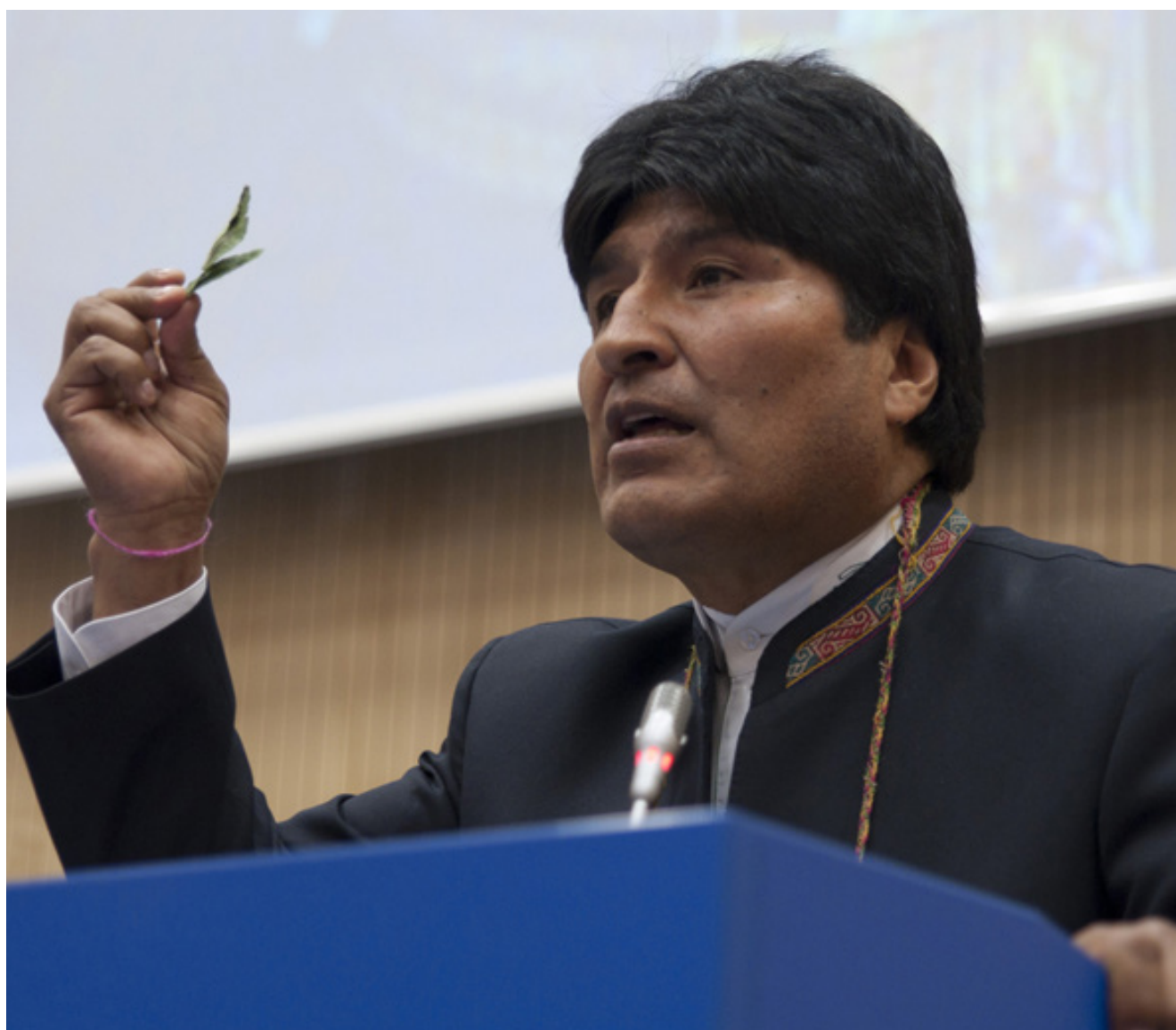
Bolivian President Evo Morales holds a coca leaf at the 2012 session of the Commission on Narcotic Drugs.

Also in 2008, the then UNODC Executive Director, Antonio Maria Costa, published a landmark report which, for the first time, openly acknowledged the negative ‘unintended consequences’ of drug control, including in terms of human rights, suggesting the need for national-level reforms. 32 Importantly, when presenting the report, Mr. Costa concluded: ‘Although drugs kill, I don’t believe we need to kill because of drugs.