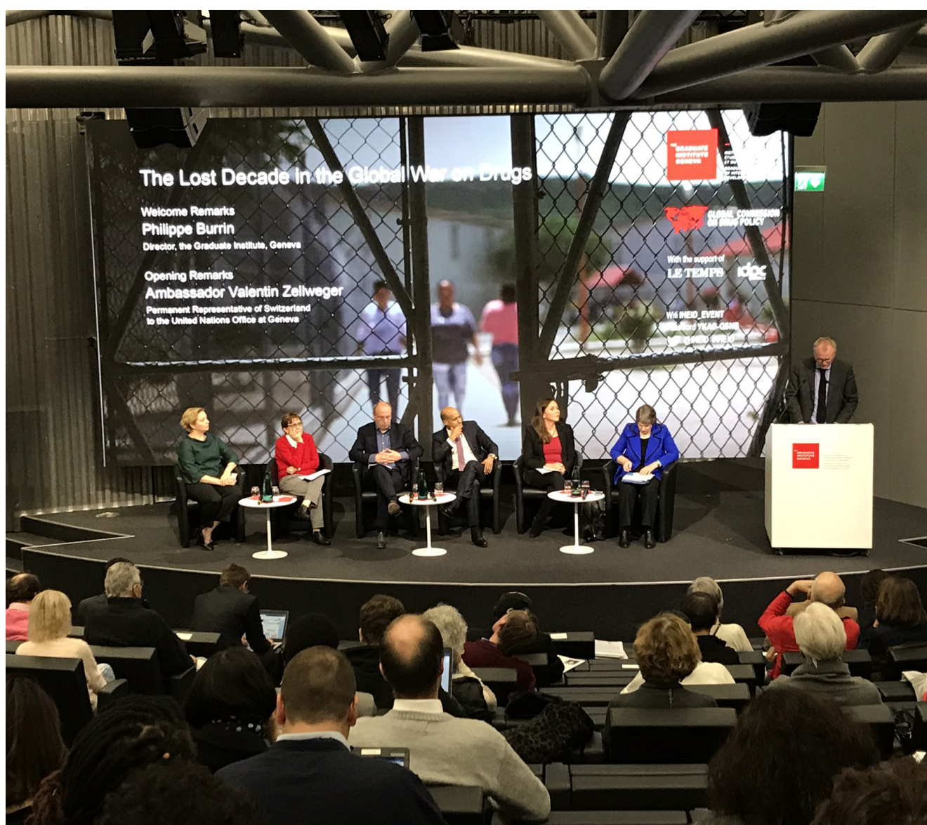
2019 Human Rights Council side event on the human rights impacts of drug policies.

The progress made at the Human Rights Council and with special mandates has run parallel with an unprecedented increase in the scope and