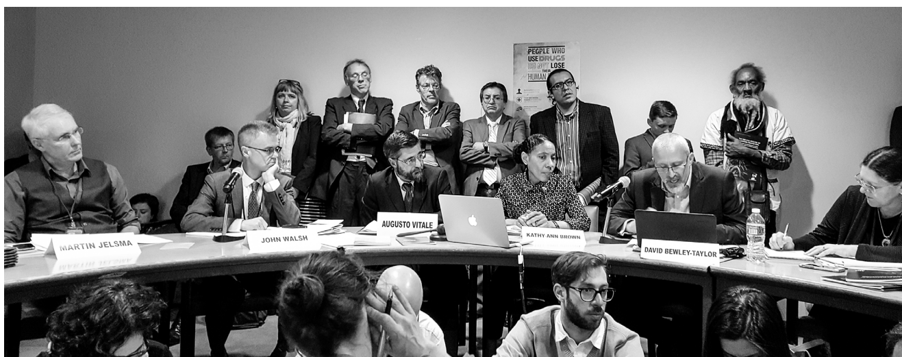
Civil society roundtable at the 2016 UNGASS.

problem on the enjoyment of human rights’ and called for a thematic session dedicated to the issue. The resolution showcased the influence that Human Rights Council can have on global drug policy debates, with three tangible outcomes. Firstly, the resolution resulted in a landmark OHCHR report on the human rights consequences of drug policies – the first ever. 66 Secondly, it directed the High Commissioner to contribute to the preparatory work of the 2016 UNGASS. Lastly, the resolution created space within the agenda of the human rights system to explicitly consider the human rights impacts of drug policies, and resulted in greater involvement by human rights mechanisms in drug policy debates, including the UNGASS.