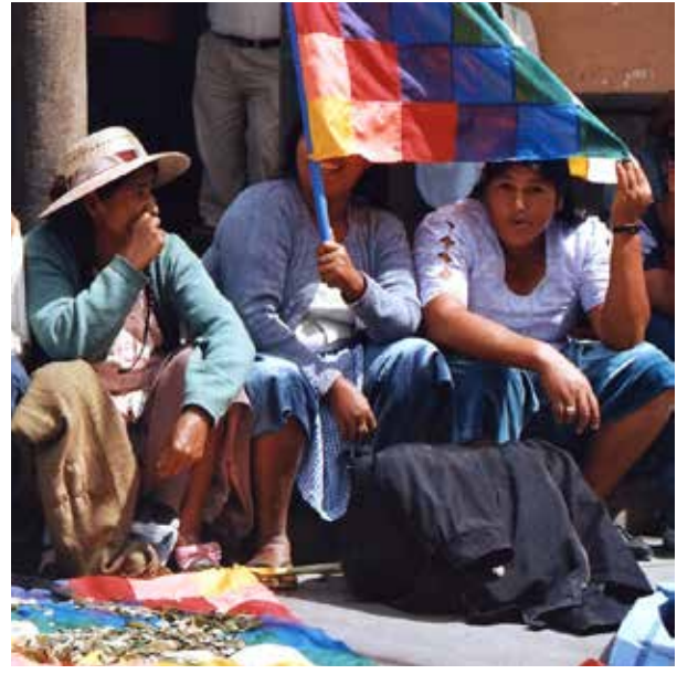
Credit: Andean Information Network. Photo taken in Cochabamba, Bolivia.

mainly in the initial stages of the coca economy, meaning cultivating, fertilizing, harvesting, and transporting coca leaves, while a smaller number of women is involved in more specialized activities, such as chemical processing.<sup>18</sup> In the case of opium poppy, women participate in the entire process, which includes preparation of the seedbed and the land, selection of the seeds, sowing, fumigation tasks to a lesser extent—due to the physical effort involved in hauling the pump with the pesticides—the scraping or slicing of seedpods at the time of harvest, and the collecting of seeds. Some women participate in the production of morphine and heroin.<sup>19</sup>