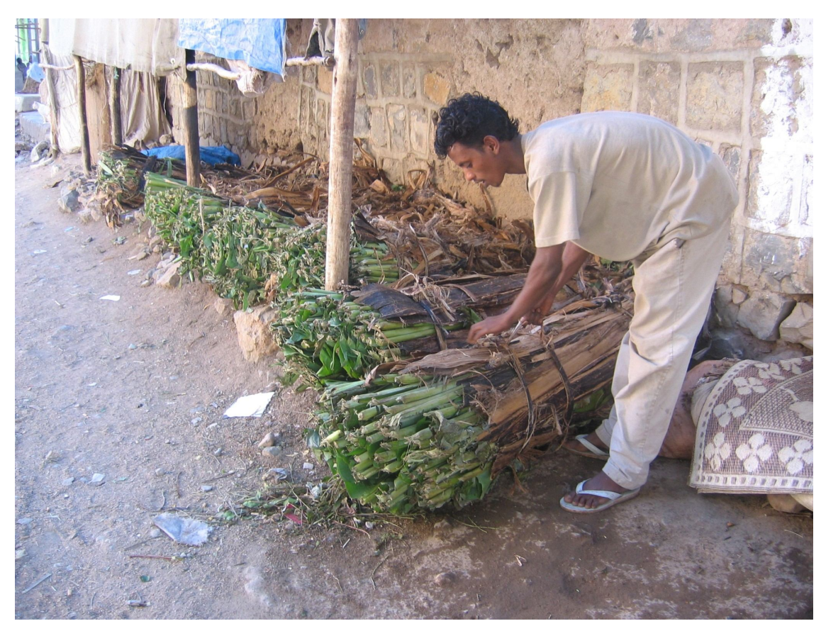
Khat prepared for export in Dire Dewa, Ethiopia

gang culture, educational under-achievement and high levels of deprivation rather than khat use. Indeed, second generation British-Somalis do not have a high level of khat use as their substance use patterns adjust to mainstream ones. There is even a reported increase in alcohol use.