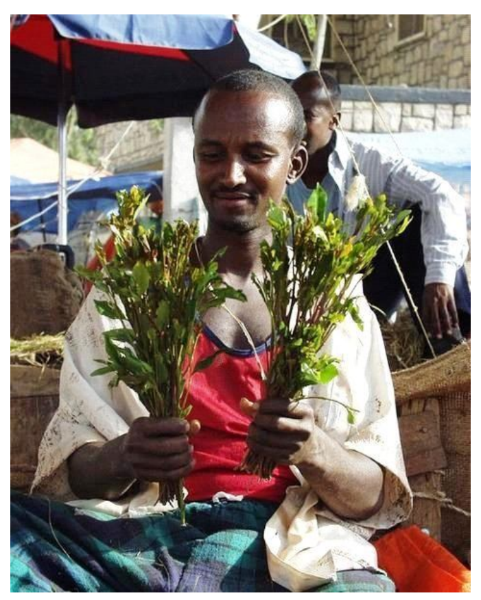
Young man with two bundles of khat

Sudan, Uganda, Rwanda and South Africa. While traders from Yemen or the Swahili coast have played an important pioneering role, the habit is quickly catching on in many of Africa's fast growing cities. In rural areas farmers are benefiting from a new cash crop. Without the know-how or resources to assess the associated risks, African governments rely on partners in Europe or international organisations for advice on regulation.