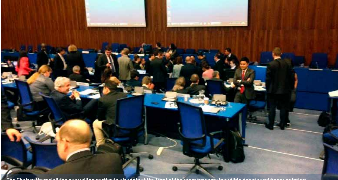
The Chair gathered all the quarrelling parties to a huddle at the front of the room for some inaudible debate and finger pointing

The highlight of this year's COW, however, came late on Friday 18<sup>th</sup> March when tired and irritable delegates were negotiating the General Assembly resolution on alternative development. Ecuador asked to amend some paragraphs that had already been agreed by the COW, which led to a scolding from Germany, Peru, Morocco, Thailand among others. Ecuador protested that they have a small delegation and were unable to be in all discussions at all times – a crucial issue with the model of informal negotiations that was raised in