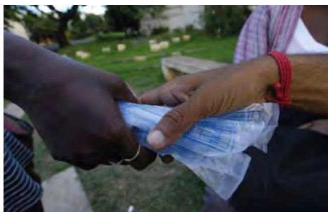
In 2009, Mauritius became the first country in sub-Saharan Africa to implement NEP

Harm Reduction policies have long been underscored by an overly clinical discourse. This approach has been adopted as it provides an escape route on the controversial question of drug policies. Focusing on the clinical, rather than the legal aspects of drug consumption avoids embarrassing funders and partners who do not wish to antagonize governments that adopt a hard-line on the legal consequences of drug consumption.