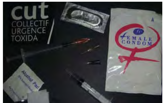
NEP clients have access to clean needles and sininges, male and female condoms, alcohol pads and dry swabs on CUT's NEP sites

There must be a continuous exercise of informing and training prison personnel on Harm Reduction. Pamphlets, posters and manuals must always be available and visible in the places where programmes are being implemented.