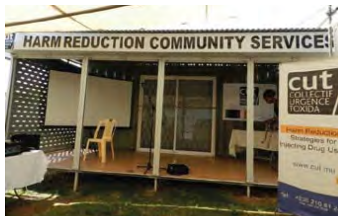
CUT's community based container offers basic health services to NEP clients and other residents of the Baie du Tombeau Area

Engage public opinion on drug policy reform: A shift in public perception to develop a sociological acceptance of Harm Reduction initiatives will help to exert pressure on policy-makers. Influential stakeholders such as local governments, the media, community leaders and businesspersons must be targeted as a starting point.