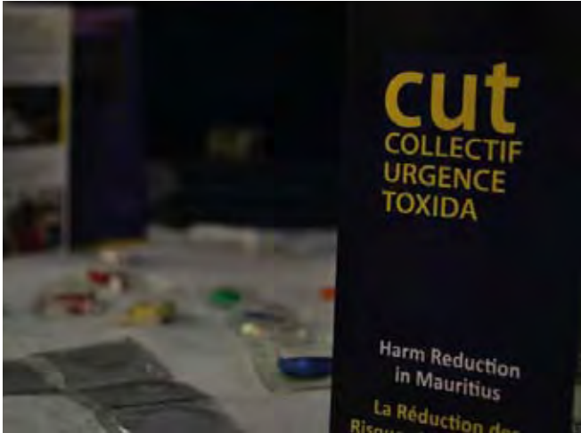
CUT is an NGO whose aim is the dissemination of Harm Reduction Services as well as Harm Reduction education

Harm Reduction is a relatively new social policy that emerged in response to the spread of HIV among PWUDs in the 1980s. It acknowledges that, despite the strongest efforts to prevent initiation to and continuation of drug use, many people throughout the world continue to use psychoactive drugs and that it is therefore crucial to reduce the risks associated with drug use. Harm Reduction challenges policies and practices that intentionally or unintentionally create or exacerbate risks and harms for PWUDs. These include “the criminalisation of drug use, discrimination, abusive and corrupt policing practices, restrictive and punitive laws and policies, the denial of life-saving medical care and harm reduction services, and social inequities.” 2