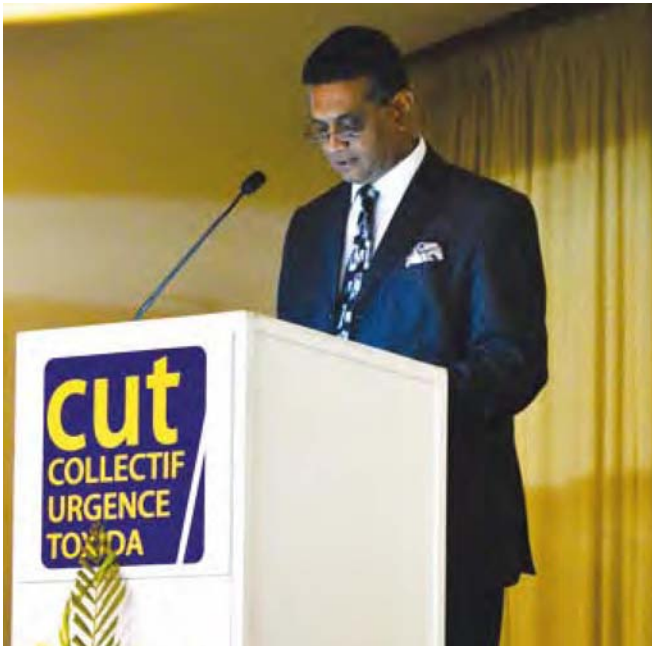
The Honourable Lormus Bundhoo, Minister of Health and Quality of Life, during his keynote address at the opening ceremony

In October 2009, the first Conference on Opiate Abuse and Harm Reduction Services in Mauritius brought together over 150 participants including civil society, government and the private sector. Local, regional and international actors working in the field of Harm Reduction contributed to a successful conference that took stock of the risks and harms associated with injecting drug use in Mauritius and the Harm Reduction responses being implemented. The second conference, held on September 20th to 22nd, 2011 was a follow up to the first and had for theme: 'A Client Centered Approach to Harm Reduction'.