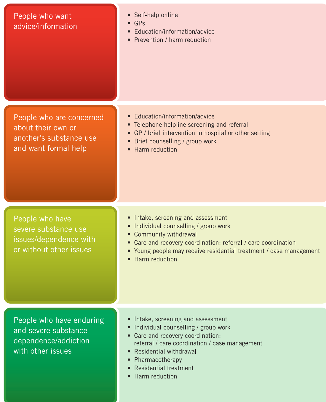
Figure 1: People who need the treatment system

We need to consider who needs treatment and what type of treatment they need. As demand for treatment increases we need to think about segmenting the treatment-seeking population so that people get the right sort of treatment for their needs, when they need it. Figure 1 below sets out a model showing different types of treatment seekers matched to their most likely treatment intervention.