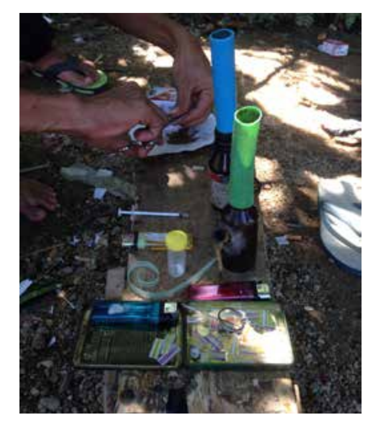
associated with avoidance of health care among PWID in Thailand.18

Human rights violations: cases of physical, sexual and psychological abuse have been documented at the hands of law enforcement, in community<sup>19</sup> and in closed settings.<sup>20</sup> The testimonies of people who use drugs indicate that bribery, drug planting, and exchange of sexual favors with law enforcement is worryingly routine, and few opportunities are available or accessible to hold law enforcement accountable.