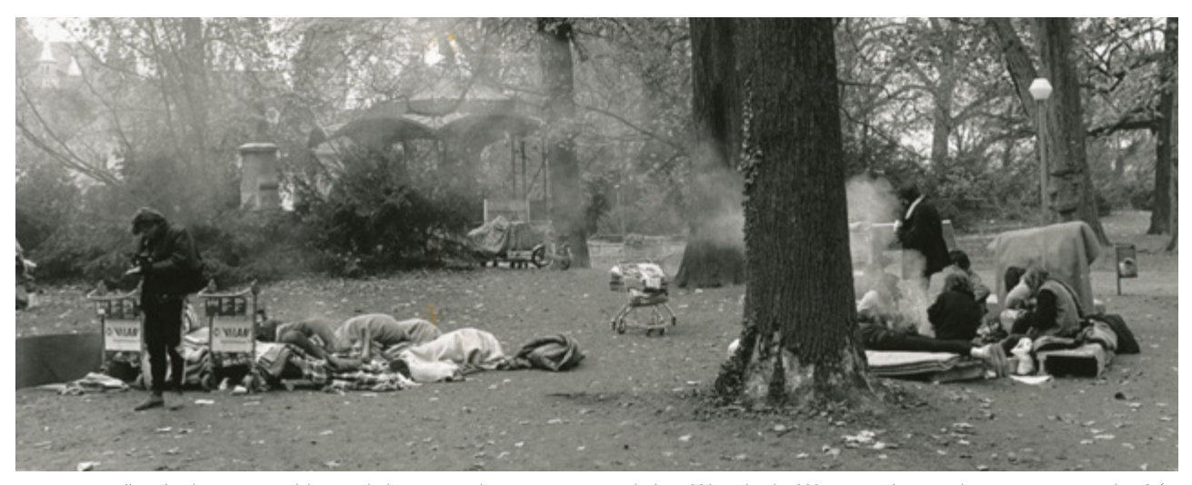
Known as "Needle Park", Platzspitz in Zurich became the biggest open drug scene in Europe in the late 1980s and early 1990s. Harm reduction and treatment services, such as Safe Injection Facilities and Heroin-Assisted Treatment, proved to be a highly effective response: the open drug scenes rapidly disappeared and drug-related deaths dropped 50% within ten years.

Another successful intervention to prevent overdose is also possibly going to be expanded. "Supervised injection facilities" (SIFs), which have a very positive trajectory in Europe, were pioneered in North America by a program in Vancouver called Insite. Supervised injection facilities allow people who take drugs to do so in safe, hygienic, calm conditions, with medical help available in the event of an overdose. No one has ever died of an overdose in a SIF, which now operate in around 66 cities in ten countries. Research on Insite suggests that it has cut the local overdose death by 35% and other studies show that SIFs increase treatment admissions, cut drug-related crime and disease and do not encourage riskier drug use. In the United States, the legal framework for SIFs is not clear,