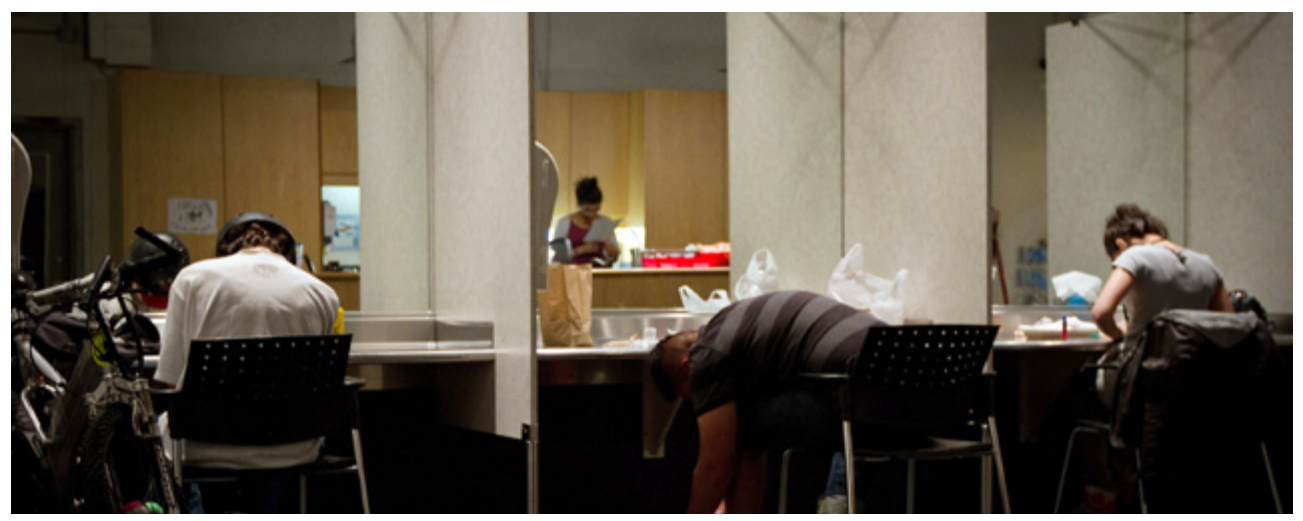
Insite in Vancouver, BC, was the first Safe Injection Facility to open in North America ten years ago.

To avoid expanding illegal markets, people who lose access to prescription opioids need to be offered immediate access to appropriate harm reduction services and treatment. No patient should be summarily cut off from opioids: if misuse is discovered, patients should be able to seamlessly transition to maintenance treatment or other alternatives as needed. Otherwise, the result will be increased amounts of harm and death.