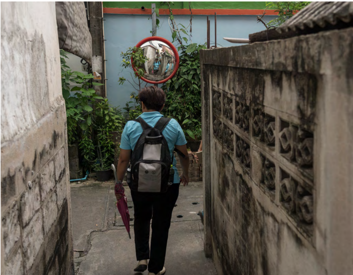
Staff from the Bangkhen community health centre go out into the community to demonstrate how they do home visits.

Beyond the community itself, if OAMT interruptions are expected, a coordinated, multi-stakeholder approach is essential. Law enforcement, health facilities, and other key actors must be informed and engaged to prepare for and respond effectively to a crisis in which large groups may experience withdrawal symptoms. Cross-sectoral coordination will help mitigate risks and maintain stability during service disruptions.