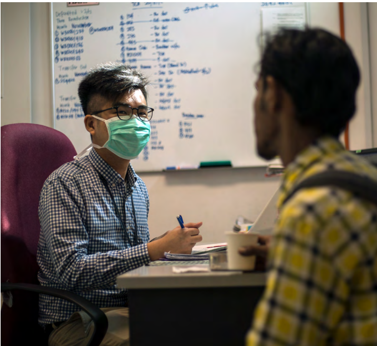
Doctor examining a patient receiving treatment with methadone at the outpatient clinic.

This guidance is based on existing WHO recommendations for opioid dependence treatment and lessons learnt from past disruptions and reduced service availability, such as during the COVID-19 pandemic (see details on the process of development in Annex I ).