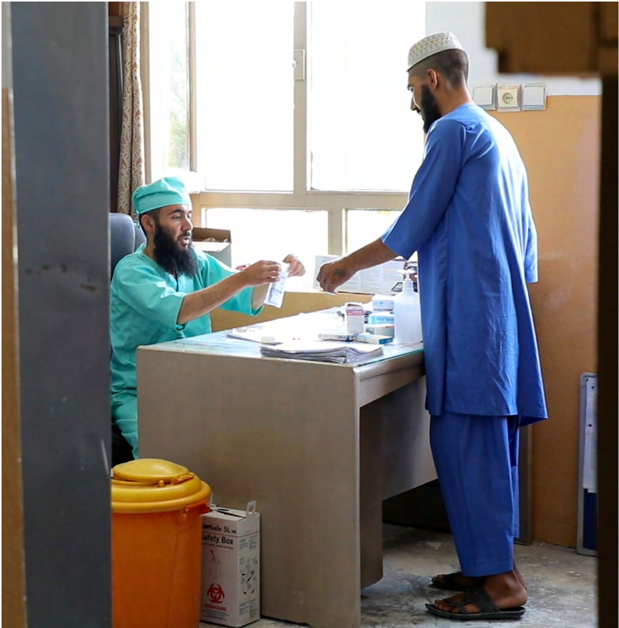
Two health care workers talking in the drug addiction treatment center in Kandahar, Afghanistan.

Distribution of take-home doses can be a rapid response measure when distribution systems are under pressure. Take-home doses can be distributed safely with appropriate safeguards, significantly reducing the strain on distribution sites and staff requirements. The number of people receiving take-home doses can be expanded and existing take-home schemes can be extended when the dose and social situation are stable and when there is a low risk of diversion for non-medical purposes. This approach was successfully used in several countries during emergency situations, including the COVID-19 pandemic, to mitigate limited access to services due to restriction of social contacts.