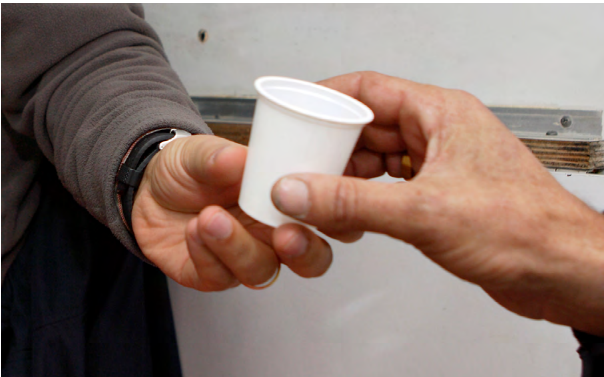
A health care provider in a mobile unit providing a patient with a methadone dose.

Buprenorphine and methadone can be used for both maintenance treatment and assisted withdrawal. Withdrawal management is, however, a distinct strategy and should not be confused with maintenance treatment. Most importantly, it should not be a stand-alone intervention. The WHO guidelines state, “Opioid withdrawal services should be structured such that withdrawal is not a stand-alone service but is integrated with ongoing treatment options”.