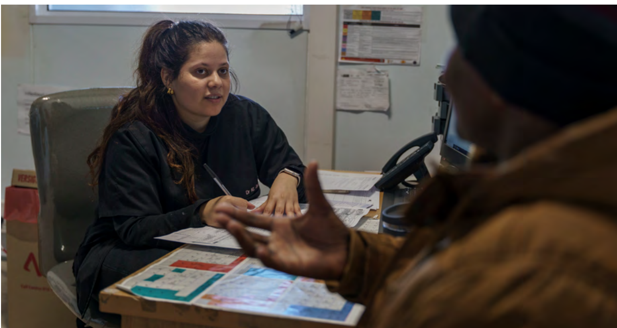
A staff member from HIV and STI prevention and treatment center in South Africa talking to a client.

Provision of structured psychosocial interventions, including counselling, peer support and crisis management, could help to mitigate the emotional and social consequences of treatment disruption. Ensuring access to such support services might improve patient resilience and engagement, even in challenging circumstances.