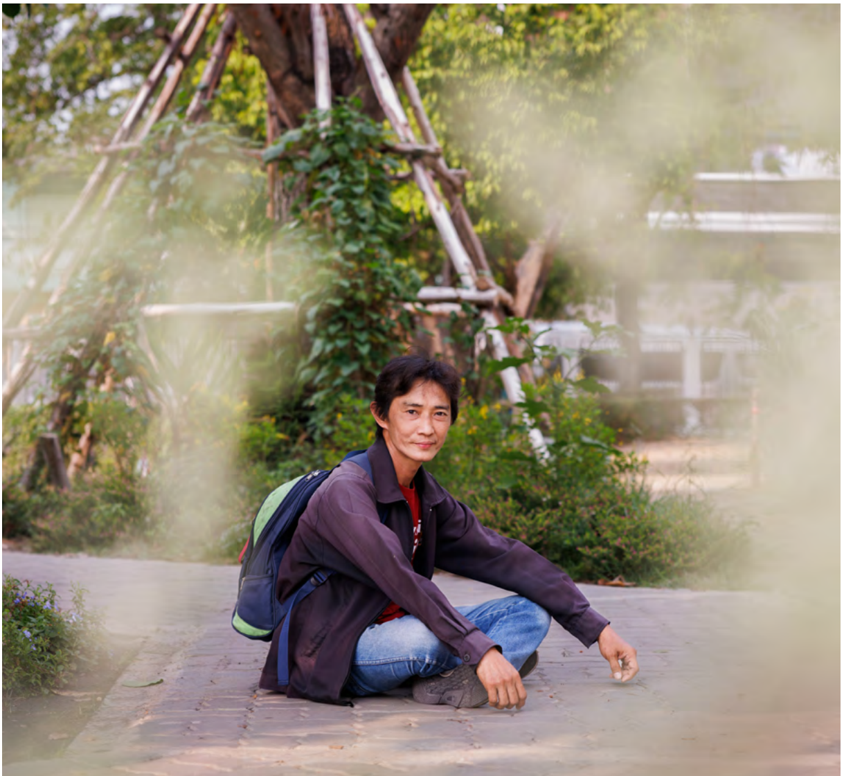
Person from HIV and HCV prevention and treatment programme in Thailand.

To maximize the safety and effectiveness of OAMT, policies and regulations should encourage flexible dosing structures, with low starting doses and high maintenance doses, and without placing restrictions on dose levels and the duration of treatment (7). Dosages can be adjusted throughout treatment; some people opt for a gradual reduction towards complete cessation of opioid use. This is not, however, a requirement, as the primary strength of OAMT lies in its long-term therapeutic approach. Any dose reduction should be person-initiated, well informed and guided by clinical best practices to ensure safe, sustained treatment benefits.