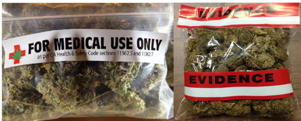
Above, cannabis as both a licit medical product and police evidence.