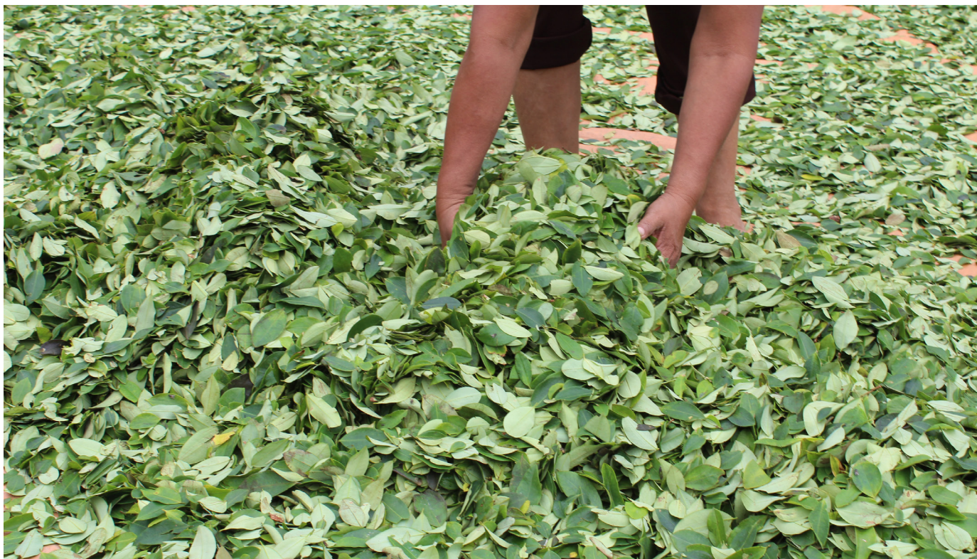
Coca is dried in Bolivia.

following the same treaty procedure, but there are differences to be taken into account. The main legal issue relates to article 19 of the VCLT, which requires that a reservation must not be "incompatible with the object and purpose of the treaty." Those overall aims of the Single Convention are expressed in the preamble's opening paragraph regarding concern about "the health and welfare of mankind" and the treaty's general obligation to limit controlled drugs "exclusively to medical and scientific purposes." Making a reservation exempting a particular substance from the treaty's general obligation to limit drugs exclusively to medical and scientific purposes is explicitly mentioned in the Commentary on the Single Convention as an option that could be procedurally allowable, for coca leaf as well as for cannabis. 47 While the absence of any accompanying cautionary text seems to imply that exemption by means of a reservation of a specific substance from the general obligations would not in itself constitute a conflict with the object and purpose of the treaty as a whole, this would certainly be an important legal discussion to be had in the context of crafting reservations. The same issues would arise with an inter se agreement (see above), which comes close to a form of "collective reservation."