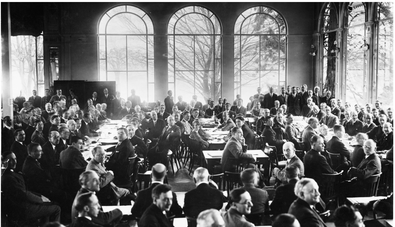
Second Opium Conference in Geneva, 1924-1925.

The Rise and Decline of Cannabis Prohibition (Transnational Institute & Global Drug Policy Observatory, March 2014), https://www.tni.org/en/publication/the-rise-and-decline-of-cannabis-prohibition