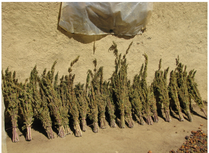
Cannabis drying in Morocco.

Moreover, what we can now see is that it is not the case that States will face significant condemnation from the international community for cannabis reforms that are increasingly common practice across the world. Opting for reform and acknowledging non-compliance can help set the stage for treaty reform options that can be implemented collectively among like-minded States, such as the inter se option.