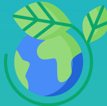
Right to a healthy environment