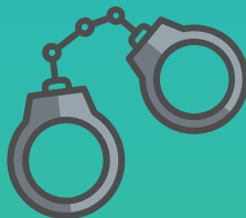
Freedom from arbitrary arrest or detention