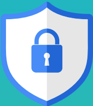
Right to private and family life