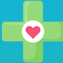
Right to highest attainable standard of physical and mental health