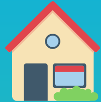
Right to an adequate standard of living