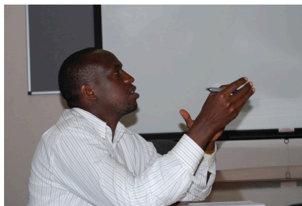
Intervention from KANCO at pre-ICASA workshop

For the past year, IDPC has been involved as a technical partner in the CAHR project. As one of the countries of focus of CAHR is Kenya, IDPC took the lead in supporting national advocacy activities in the country, in partnership with the Kenyan AIDS NGOs Consortium (KANCO).