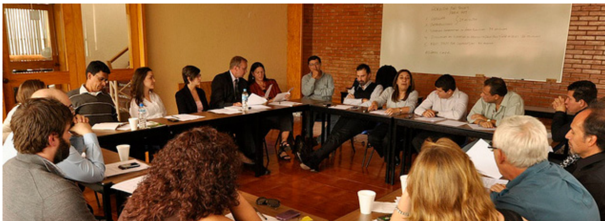
Informal meeting between NGOs and policy makers in Mexico City, Mexico

region. In the margins of the meeting, IDPC members had the opportunity to engage with prominent academics and officials from the Centro de Investigación y Docencia Económicas (CIDE) , a Mexican research institute, and the Human Rights Commission of the Federal District of Mexico to present the work of IDPC and of the Global Commission . The Mexico conference was also an opportunity for all IDPC members to meet in order to review new opportunities for regional advocacy, our future work plans, and improving internal communications.