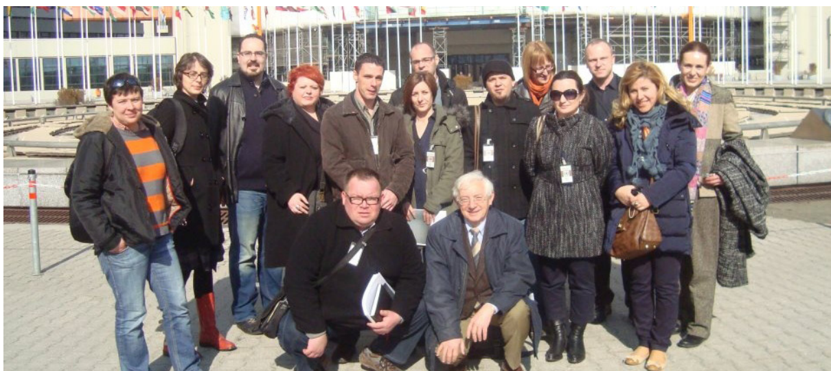
The South East Europe Drug Policy Network at the Vienna International Centre, Austria