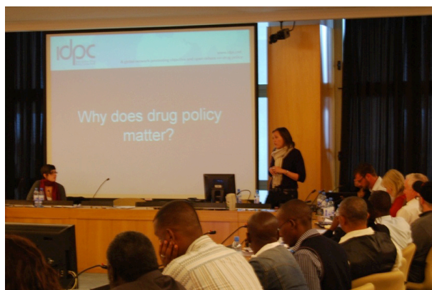
IDPC presentation at pre-ICASA workshop

Sub-Saharan Africa has been one of our priority regions this year. We are delighted to have welcomed our first member in the region, the Collectif Urgence Toxida (CUT), from Mauritius.